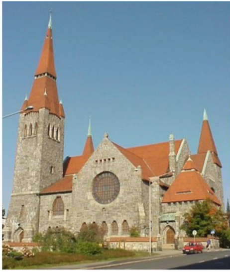
The cathedral of Tampere