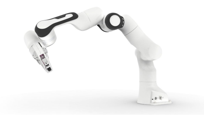
Figure 1: Franka Emika Panda robotic arm

The Panda offers a graphical UI called Desk : an intuitive interface that runs on all web browsers and does not require software installation. In Desk you can easily