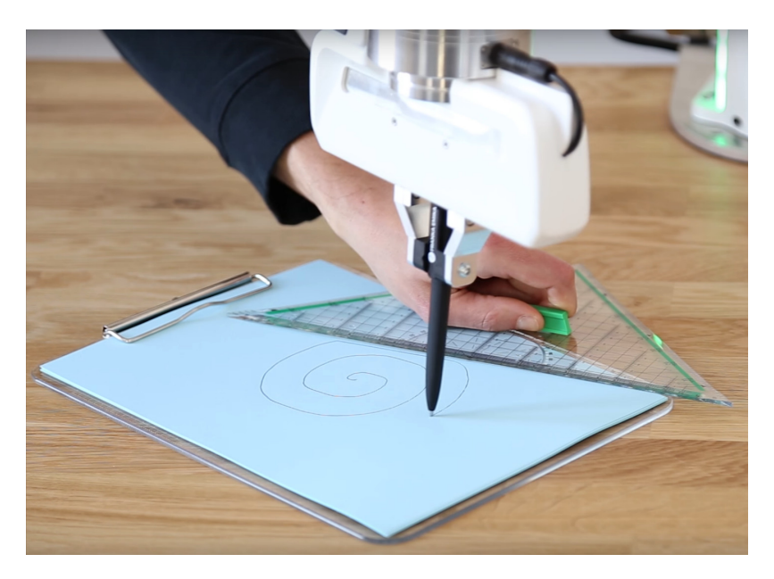
Figure 3: The setup for Task 3

Task 3 In the third task the robot will be setup with a pen in its gripper and a sheet paper will be positioned on the table. On top of the sheet of paper, a ruler will be placed. The robot has to perform a spiral motion in contact with the paper. Whenever the pen touches the ruler, the robot should follow the ruler and then continue the spiral trajectory, as shown in Figure 3.