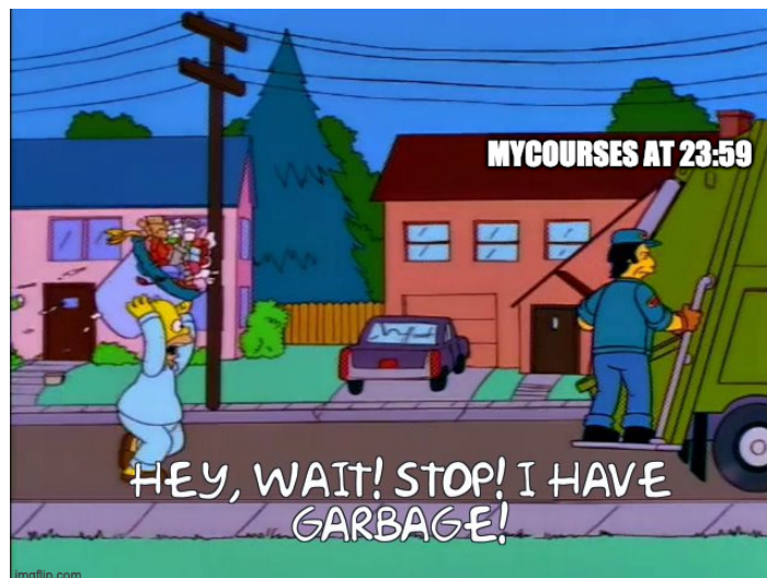
Homer Simpson returning a last-minute assignment. Don't be like Homer.

If you submit an assignment that does not meet the standard of ‘satisfactory’, I will ask you to revise your work until it meets the standard. However, assignments that are clearly incomplete and indicative of rushed last-minute work – stream of consciousness text with no coherent logic or structure, very superficial treatment of required components, or missing components altogether – will be regarded as ‘missed’ and will not be sent back for revision.