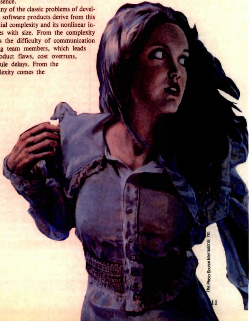
The Photo Source International, Inc.

Conformity. Software people are not alone in facing complexity. Physics deals