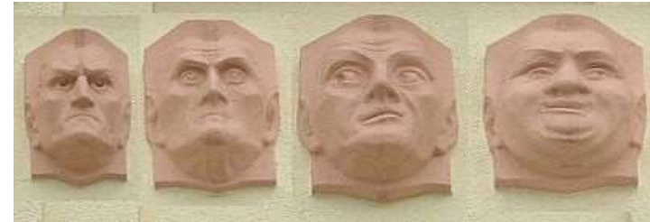
choleric sanguine melancholic phlegmatic

Funny (?) facts from history: personality types show in the facial (and skull) structure – and thus leaders can be recognized (phrenology in the late 19th century)