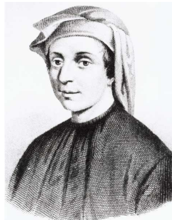
Leonardo of Pisa, known as Fibonacci, by unknown artist, Born c. 1170, died c. 1250.