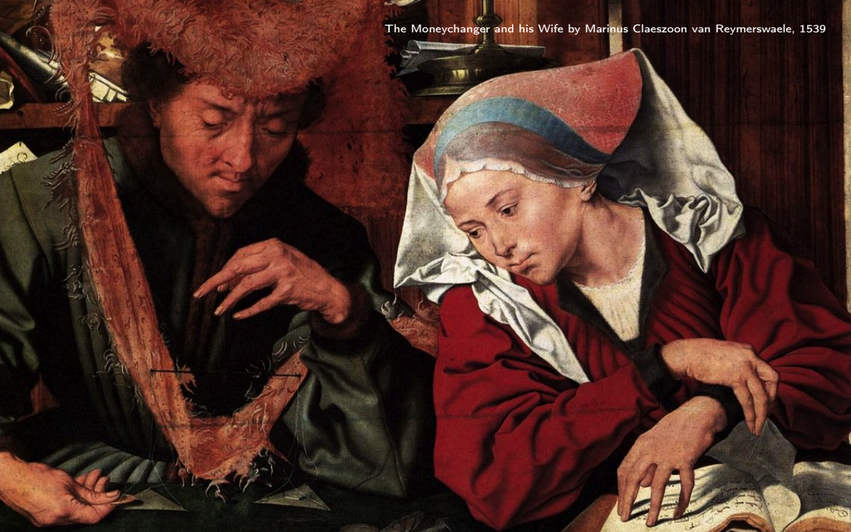
The Moneychanger and his Wife by Marinus Claeszoon van Reymerswaele, 1539