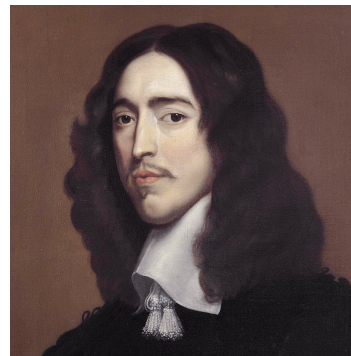
Jan de Witt (1625–1672), a mathematician and key political figure in the mid-17th century Netherlands, published his Value of Life Annuities in Proportion to Redeemable Annuities in 1671