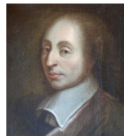
Pierre de Fermat (top) and Blaise Pascal (bottom).