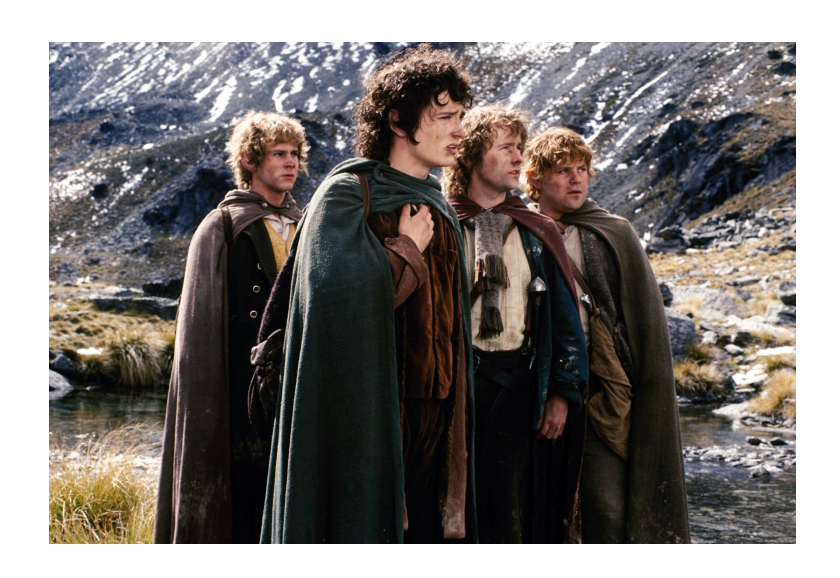
Strategies are understandable, coherent, evocative, inspiring, rememberable, aspirational, and create meaningful continuity from the past to the future