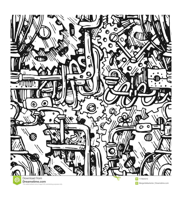
Strategies create thought-out, aligned, coordinated, and effective companies