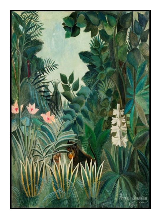
Strategies lead to organizations that are alive, synergistic, evolving, learning, and adaptive