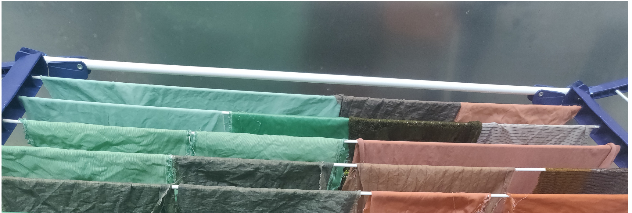
Two dye batches (green and salmon pink) with different types of cellulose fabrics, photo: Maija Fagerlund

All animal fibres are made of protein, and most of the plant fibres consist of cellulose. Synthetic fibres are oil-based and thus in many ways similar to plastics, and regenerated fibres are cellulose based. They are made of plant material or recycled cellulose products with a chemical process.