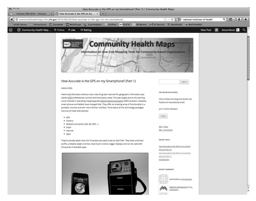
Figure 5.2 Information blog post

The screenshot in Figure 5.2 shows a post from one of the National Institute of Health's (NIH) blogs and is a good example of an informational article. You can read the entire post at the Community Health Maps website.<sup>4</sup> http://communityhealthmaps.nlm.nih.gov/2014/06/30/how-accurate-is-the-gps-on-my-smartphone/