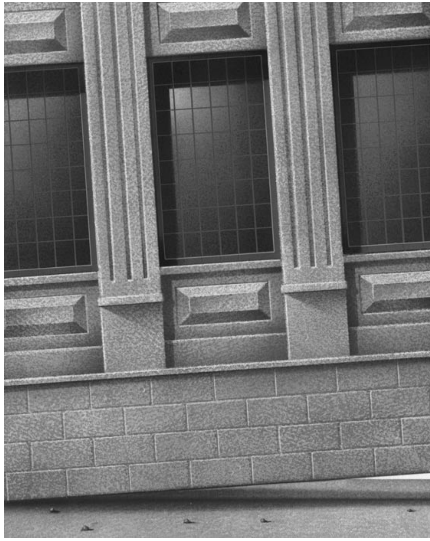
Copyright @ 2001 by Jim Collins. All rights reserved.