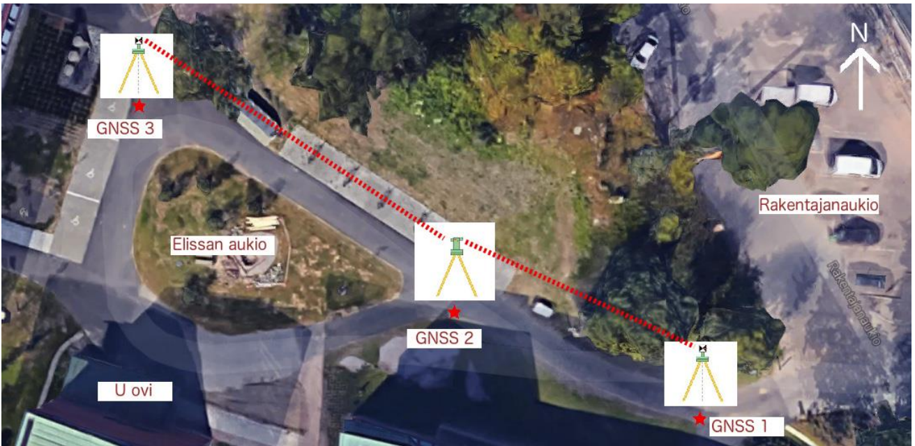
Figure 2: Measurement situation for points GNSS-1 ja 3.