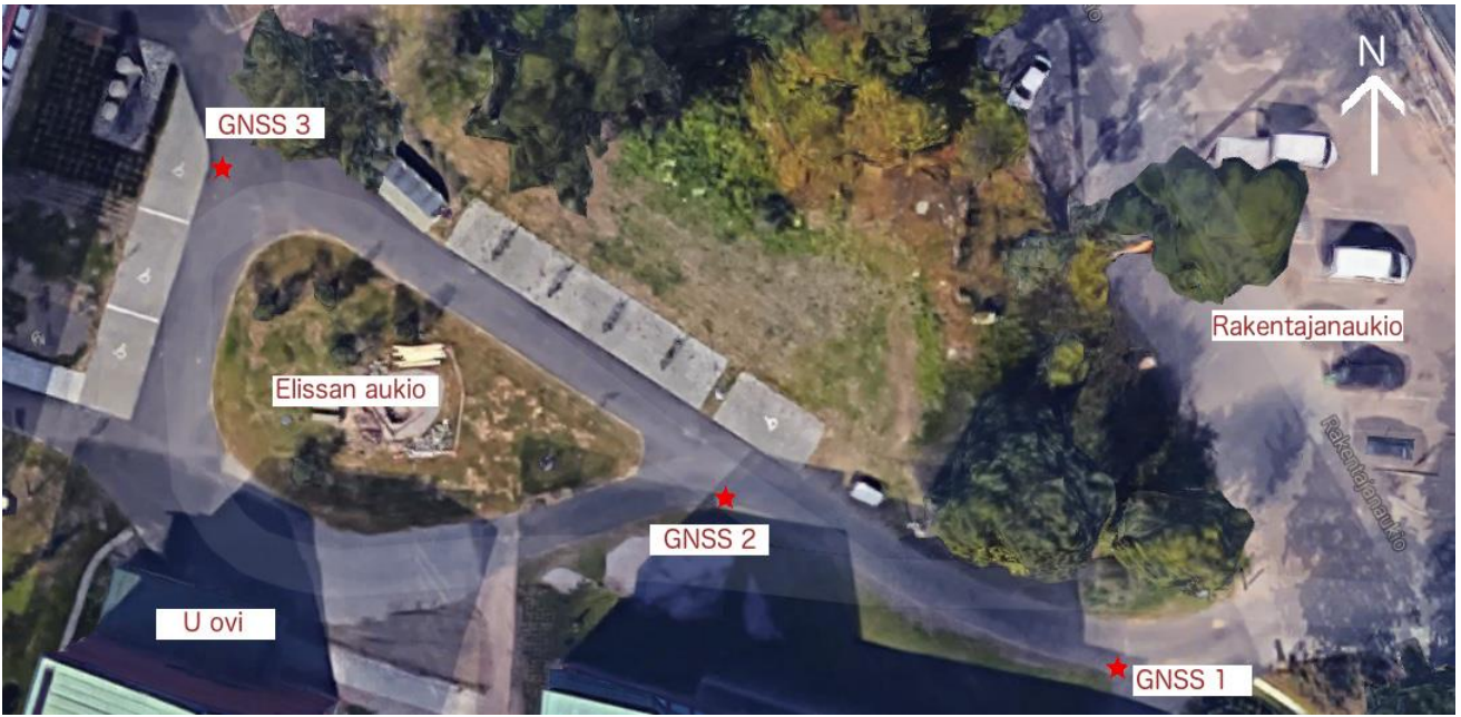
Figure 1: Known points for the measurement, GNSS 1–3.