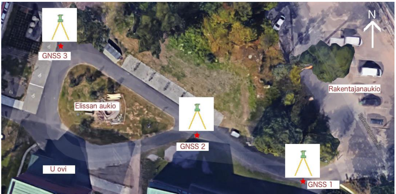
Figure 4: All tacheometer stations have been determined, the mapping can start.