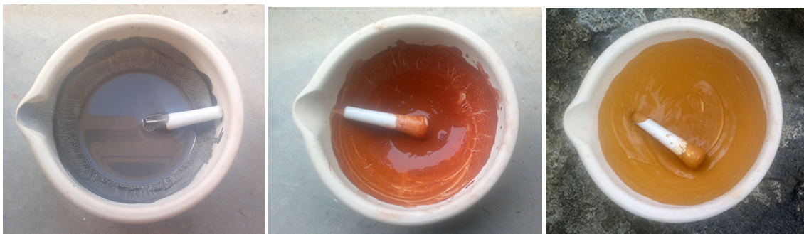
Figure 4: (a) Black sand, (b) red stone and (c) yellow sandstone ground and mixed with water, January 2015.

At that time, I made my first test pieces in clay. In Hobart, my host was a ceramist, and she supplied me with recycled clay from a project she was currently working on. From this clay, which was white porcelain, I made test pieces that were then dipped in the three liquids (Figure 4). The test pieces were fired up to 1,260 °C. From these results, I could see that the black sand had smoothly melted on the top of the clay, and the colour varied from black to dark brown. The two other tests were different as the structure of the liquid was more granular. In addition, the colours had lost their intensity. Based on these results, I decided to continue my experiments in ceramics mainly with the black sand.