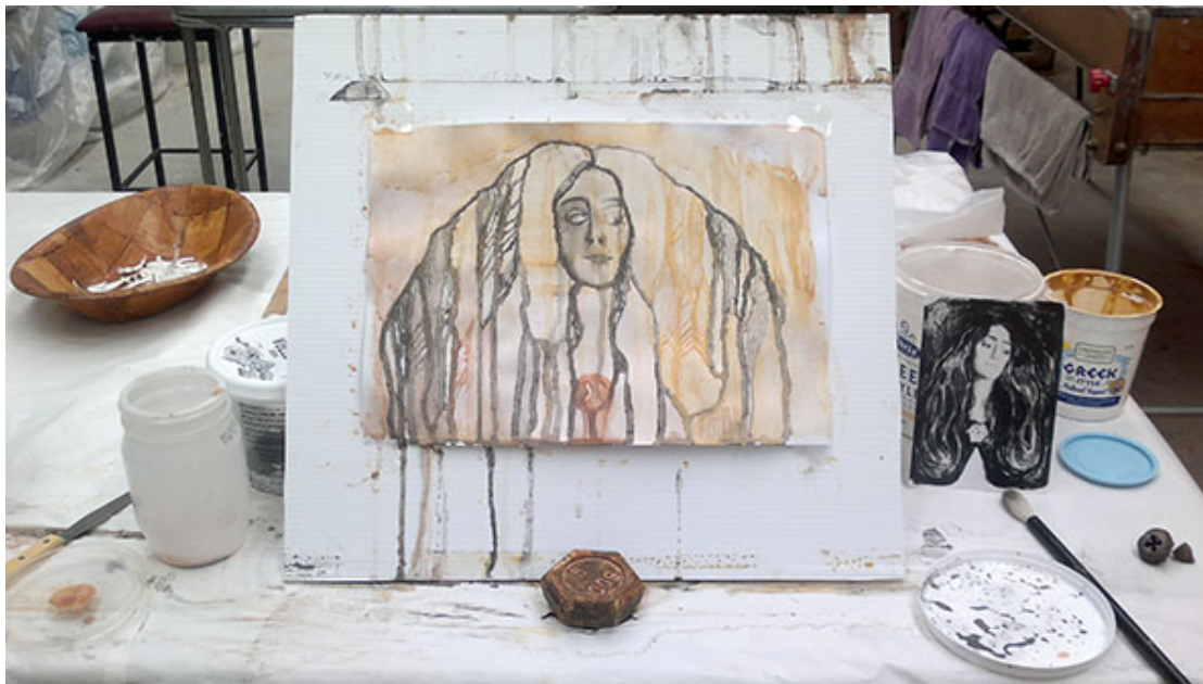
Figure 7: Earth painting in the studio inspired by Edward Munch's lithography (figure on right), February 2015.

This multisensory experience corresponds to Tim Ingold's (2000; see also Pink, 2011, p. 266) proposal in terms of the relation between the eyes and ears: as the sensitive surfaces of the skin, these senses should not be understood as separate keyboards for the registration of sensation. Instead, 'they are to be understood as integral parts of the body that is continually on the move, actively exploring the environment in the practical pursuit of its life in the world' (Ingold, 2000, p. 261). Furthermore, he considers looking, listening and touching not as separate activities but, on the contrary, as different facets of the same activity – that of the whole organism in its environment. For me, the event in the forest was an important embodied experience during which I finally understood how the hair of the female figure should be painted. When I reached the studio, I painted the inner scenery on the paper (Figure 7).