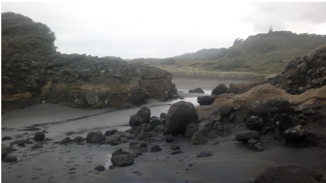
Figure 1: Black sand in Te Henga, Auckland, October 2014.

Even though my roots are in Finland, the context of this case study is Australasia, where my 2015 artistic practice occurred. The stay preceded a short preparatory trip to New Zealand. During this stay, I collected some samples of the local soil. This was not a planned endeavour but rather an unintentional occurrence that happened during my walks in the local surroundings – the forests and beaches in Auckland (Figure 1). The walks resulted in a collection of tiny gatherings of ochre, yellow sandstone and black sand. The most unique was the black sand as this was something that I had not seen before.