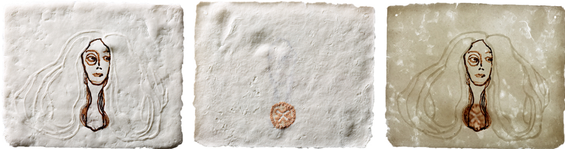
Figure 5: Double-sided painting on porcelain: (a) front painting with black sand and porcelain; (b) back painting with yellow stone; (c) front of the slab with proper lighting, February 2015.

Because of the success of the experiments, I continued by experimenting on the same topic in the form of double-sided ‘ceramic paintings’. This resulted in pieces in which the final picture evolved on the top of the ceramics when light passed through the slab, making visible the white lines that had been painted on top of it. On the other side of the slab was the painting with black sand. The final image evolved on the top of the transparent slab with the aid of light as this combined these images into a single entity (Figure 5). At this stage, I felt that I was still too closely attached to Edward Munch’s original figure and wanted to bestow my own touch on the image. I tried to modify the hair of the figure but could not get rid of the round forms that are typical of Munch’s expression.