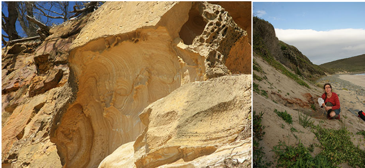
Figure 2: (a) Yellow sandstone in Orford, January 2015; (b) gathering ochre samples on Bruny Island, February 2015.

In addition to the yellow sandstone (Figure 2a), I gathered small red stones from the beach. Together with the black sand, these formed the collection on which I based my first material experiments.