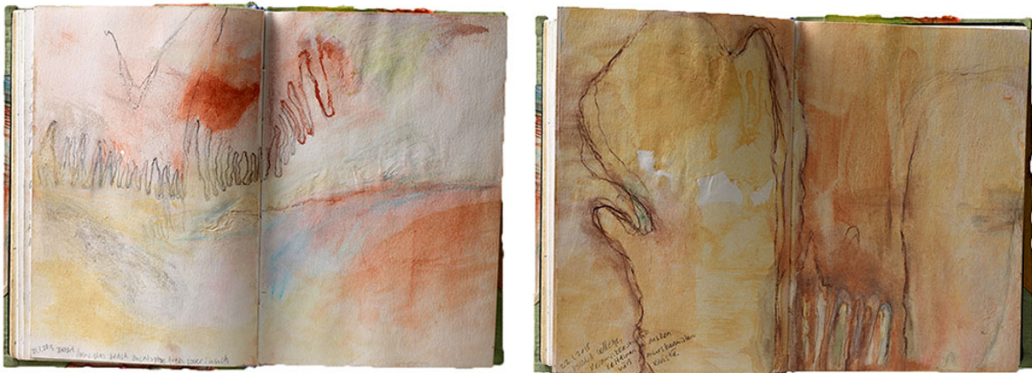
Figure 3: Painting experiments with (a) watercolours and stone and (b) stones. Maarit Mäkelä's working diary 21-22 January 2015.

Following this, I painted figures with these colours. The result was surprisingly good, and I decided to follow this avenue in the painting experiments.