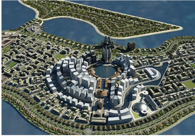
FIGURE 6 Kinshasa: Cité le Fleuve

NOTE: Plan/graphics developed by Hawkwood Properties ( http://www.lacitedufleuve.com/aboutus.php ). The major shareholder is Mukwa Investment ( http://www.hedgeweek.com/2007/01/19/hedgeweek-interview-hillary-duckworth-chief-investment-officer-mukwa-fund-unearthing-oppo ).