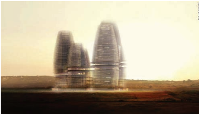
FIGURE 4 Hope City, Accra

NOTE: Plan/graphics developed by Italian architects OBR ( http://www.obr.eu ).