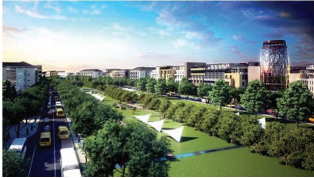
FIGURE 2 Tatu City, Nairobi

NOTE: Plan/graphics developed by Rendeavor (Renaissance Group) ( http://www.rengroup.com/UrbanDevelopments ).