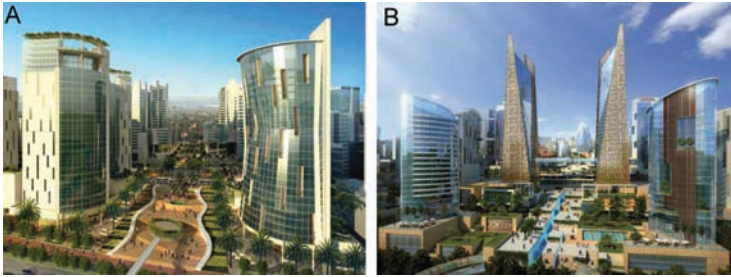
FIGURES 1A AND 1B Kigali Conceptual Master Plan

NOTE: Plan/graphics developed by OZ Architects, Denver, USA ( http://www.ozarch.com ) and Surbana ( http://www.surbana.com ).