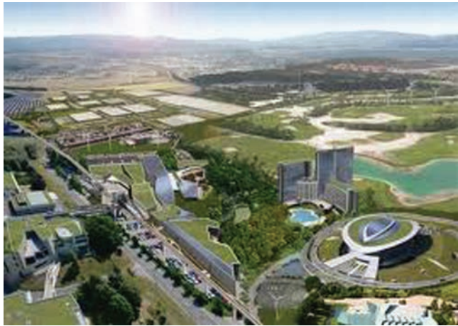
FIGURE 3 Konza Techno City, Nairobi

NOTE: Graphics developed by Pell Frischmann ( http://www.pellfrischmann.com/search.php?query=Konza+City&x=10&y=11 ).