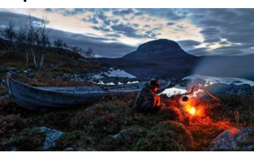
Lapland tourism firms are still hoping that government will greenlight visitors from selected countries.

Finland adopts 3-phase action plan to slow Covid spread