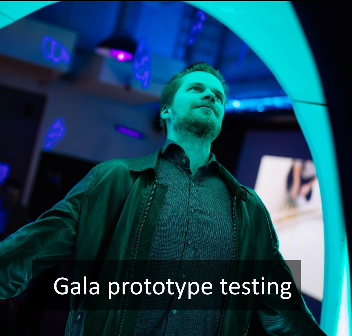
Gala prototype testing