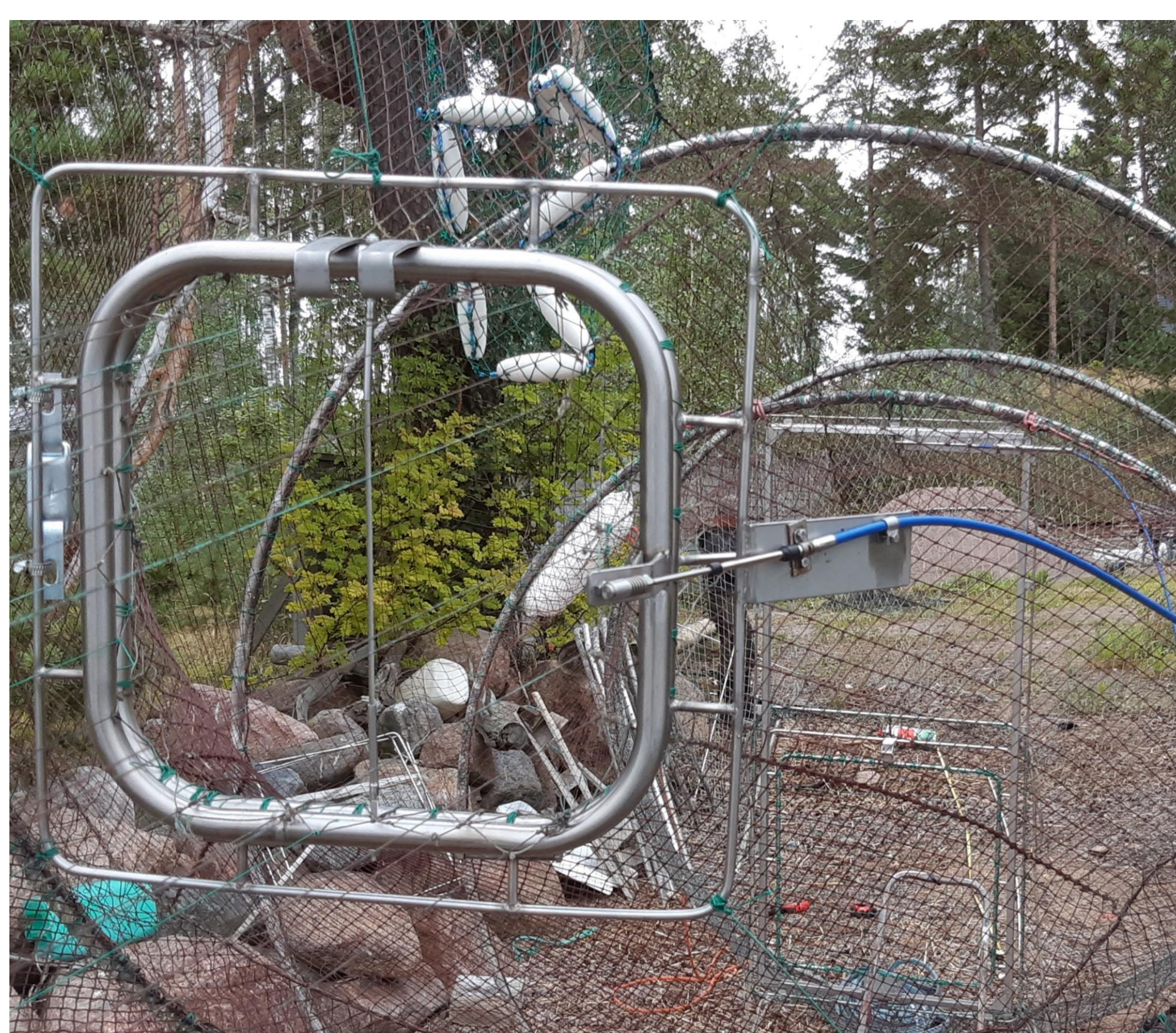
Pontoon trap gate (40 x 40 cm)

When entering the last chamber fish swim through the small gate frame. That allows real time sensors/cameras/IoT solutions in order to measure the number of fish and different species caught.