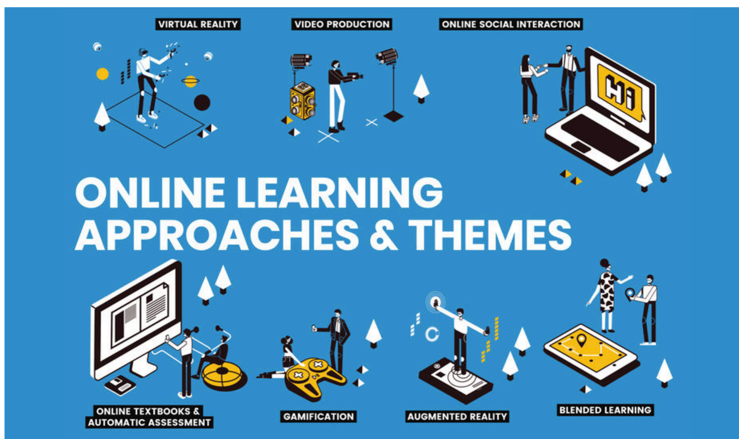
Aalto Online Learning approaches and themes.

A good idea for a visualisation requires inspiring examples and an understanding of psychology as well as the available methods.