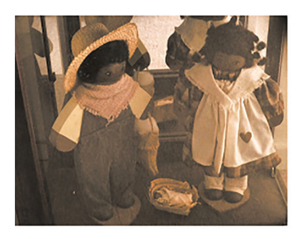
FIGURE 4 ADAM'S BLACKNESS-THEMED ART