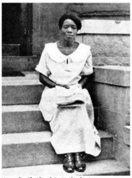
Neatly Clothed & Orderly Appearance

terms, but they did so squarely within the bounds of a cultural logic that placed few limits on sexualized aggression toward black women and girls (Griffin 2000). Consequently, they mobilized around self-reform, rarely making demands of employers, local law enforcement, or city officials. Instead, they made substantial demands of their presumed moral charges, often prevailing on race, gender, and status stigma to enforce conformity to strict instructions on how to dress, stand, sit, eat, and otherwise comport with the ideals of elite Victorian femininity (Griffin 2000; Walcott 2001).