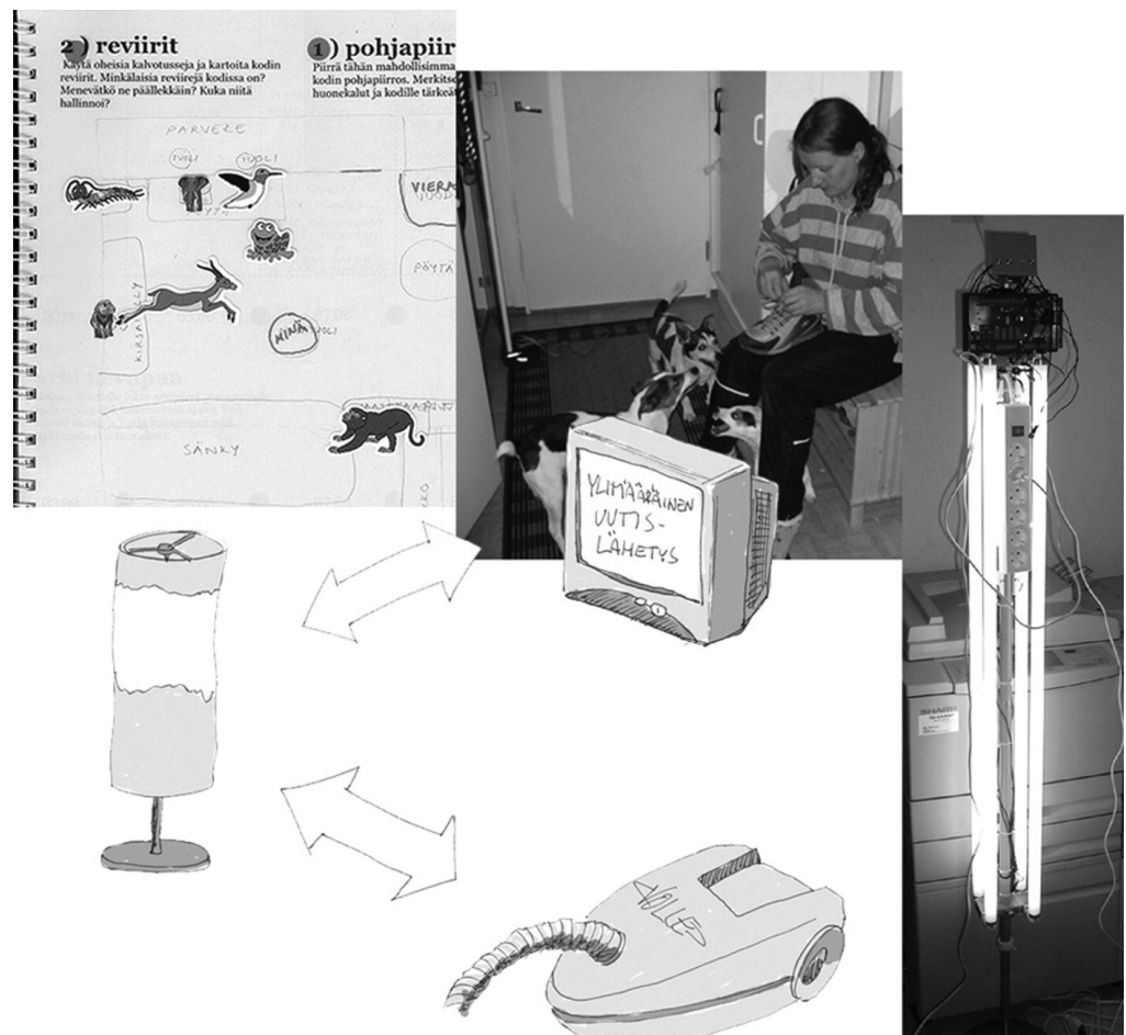
Figure 2. Pictures from Morphome. Clockwise: probes (detail), one home, IKEA-style lamp with technology exposed, scenario about the lamp talking to a TV and vacuum cleaner.

In Field, the way in which use context is brought into design is different from Lab and Gallery: here it is typically ordinary people leading their ordinary lives who become the context. As Kurvinen et al. (in press) have argued, one should design research so that the artifact is placed into an ordinary social setting in which it is followed using naturalistic research design and methods over a sufficient time span so that social processes have time to evolve. They also stress that the artifact should not be understood as stimuli in a laboratory, and that one should pay special attention to the sequential unfolding of events. Under these conditions, the artifact acquires several meanings in social action, and these meanings can be studied empirically. Here, design experiments become social objects; people talk about them with others. People do not just make sense of experimental designs. They also use them, compare their interpretations, and even come into conflict with each other because of the experiments. Experimental designs are also typically not the center of attention, as in other approaches, but take on a far more peripheral role as they commonly do in ordinary life.