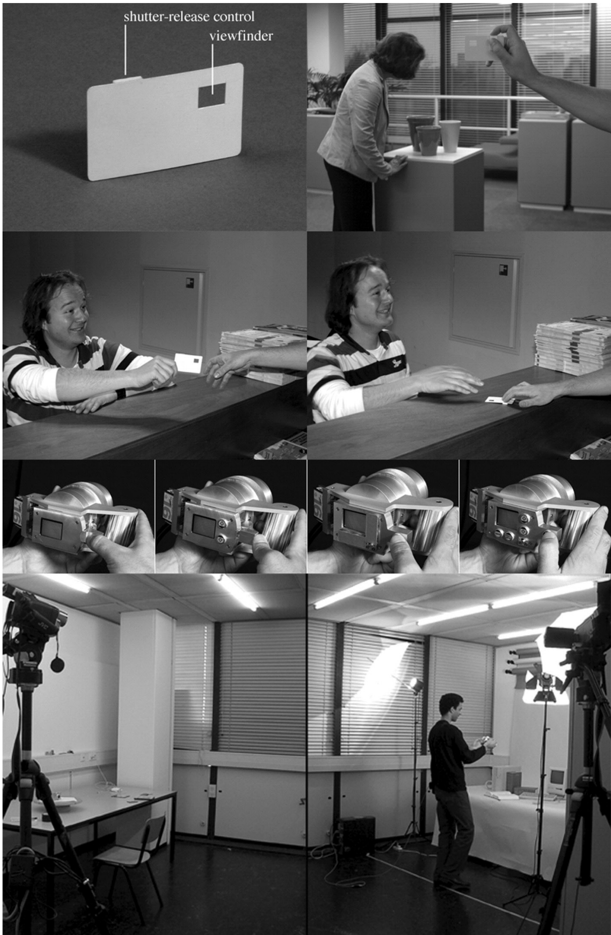
Figure 1. Research design in Frens (2006a,b). Top: An early interaction and service scenario. Middle: four variations of the prototype. Bottom, left: setup for viewing, right: setup for taking pictures.