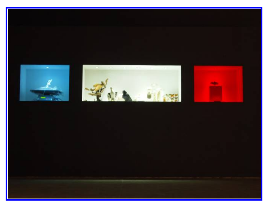
Fig. 3. 'Odd Neolifism', The Tissue Culture & Art Project, 2010.

there is still the need for a serum created using animals' blood plasma. Although some research to find alternatives is underway there are no immediate solutions and animals (mainly calves or fetal bovine) are killed for it. Second, all the 'costs' concerned with the running of a laboratory, i.e. fossil fuels burned, green house gases produces, water and trees consumed, miles travelled and the waste created mean that the ecological footprint of in-vitro meat is significant. Third, there is a shift from 'the red in tooth and claw' of nature to a mediated nature. The victims are pushed farther away; they still exist, but are much more implicit. It should be remembered that animal cells cannot manufacture nutrients from nothing; in-vitro meat is merely an engineering exercise in translating/synthesising nutrients from other sources. In other words, parts of the living are fragmented and taken away from the context of the host body (and this act of fragmentation is a violent act) and are introduced to a technological mediation that further 'abstracts' their liveliness. By creating a new class of semi-being, which is dependent on us for survival, we are also creating a new class for exploitation, as it further abstracts life and blurs the boundaries