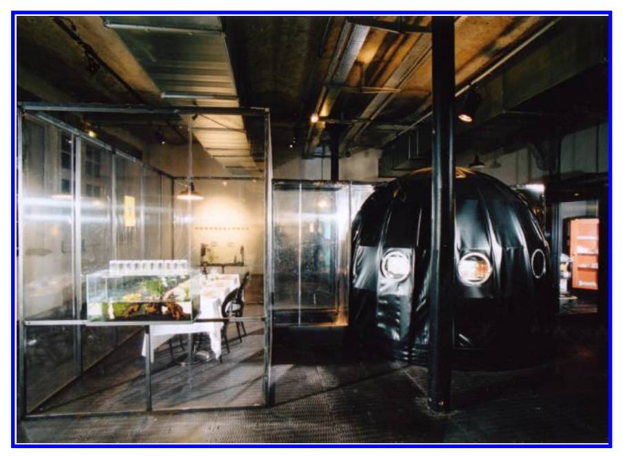
Fig. 2. 'Disembodied Cuisine', The Tissue Culture & Art Project, 2003.

time, a very public presence of the FBI. At iGEM; FBI agents engaged with the teams and urged them to work closely with government agencies and safety officials.<sup>7</sup> In 2010 iGEM saw even more teams working with designers as advisors as well as at least two artistic teams that entered the competition, including a new Srishti team with a project that demonstrated how the engineering of one organism influences the phenotypic behaviour of another.