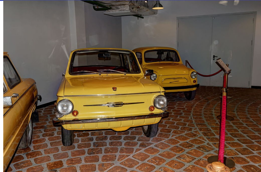
Arkhangelskoye. Vadim Zadorozhny's Vehicle Museum. ZAZ-968 and ZAZ-965