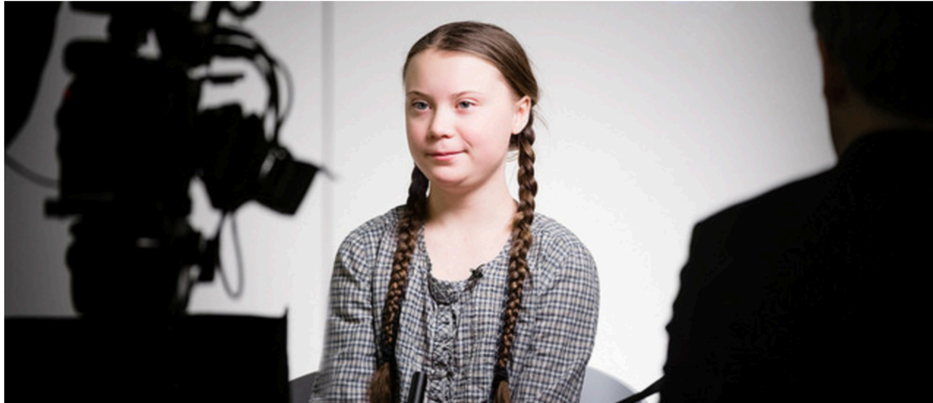
Greta Thunberg has a message for world leaders