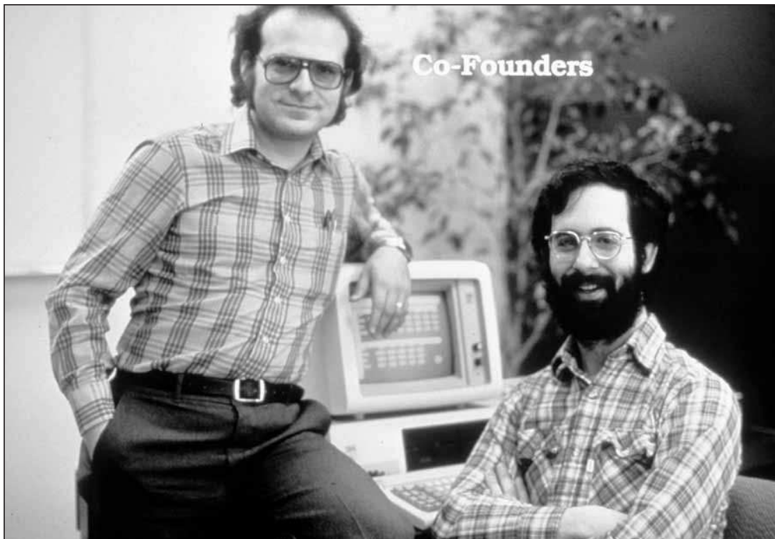
Bob Frankston (standing) and Dan Bricklin, circa 1982

Even though it seems like it’s big business and impersonal, and “they” take care of it, it really isn’t. There is no “they.” It always comes down to an “I” of somebody, and in many cases, it’s a principal.