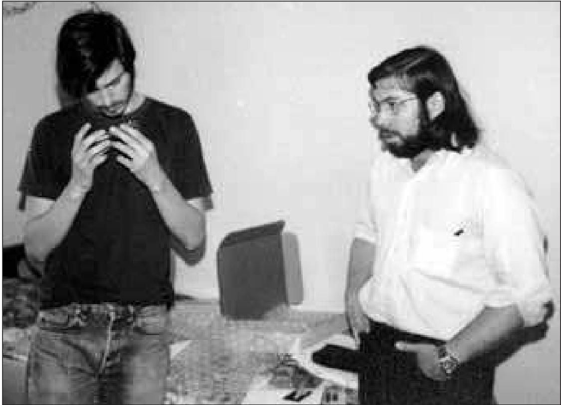
Steve Jobs (left) and Steve Wozniak (right) in 1975 with a blue box