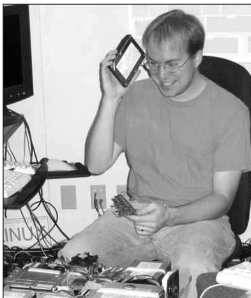
Repairing the disk electronics on an early Gmail prototype.