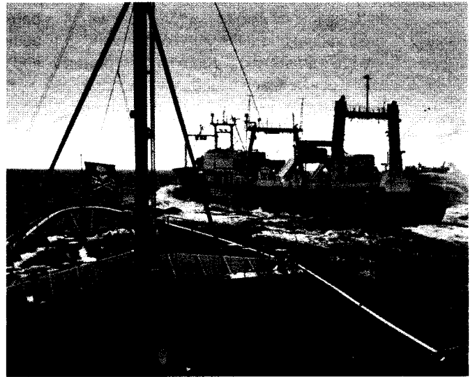
Sea Shepherd M/Y Robert Hunter trails Japanese whaling fleet's factory ship, the Nisshin Maru, in the Southern Ocean Whale Sanctuary off the coast of Antarctica, February 9, 2007