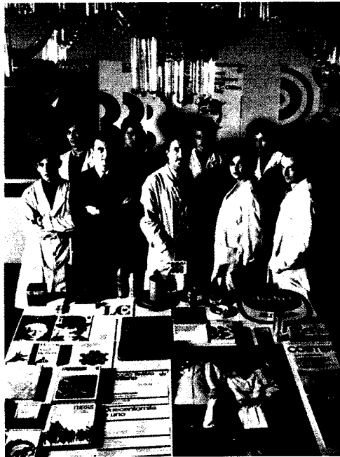
Members of the Unimark International studio, Milan, 1966