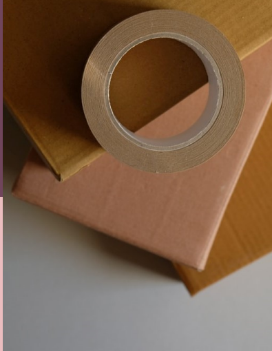
E-COMMERCE & PARCEL DELIVERIES