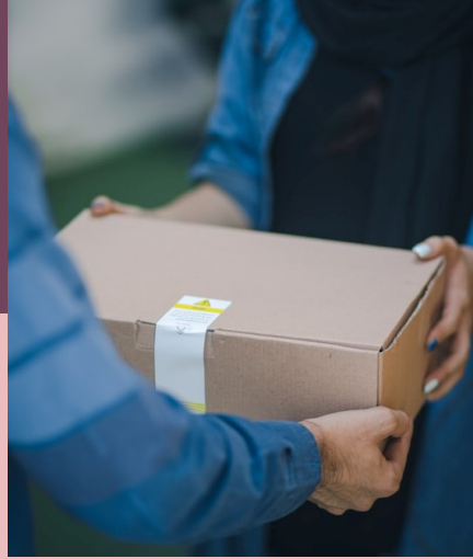
EFFORTLESS LOGISTICS SERVICES