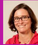
Manager, International Relations,