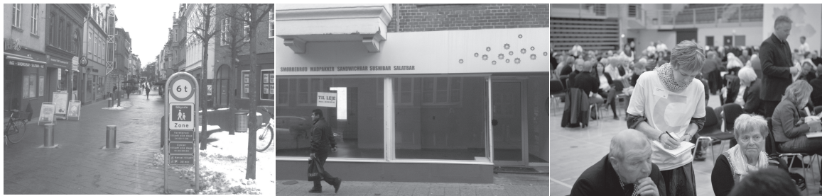
Kolding - We Design for Life Together we design options for a good life through entrepreneurship, social innovation and education