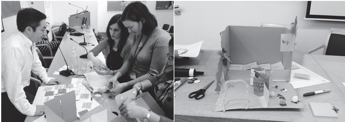
8.1 UK government Cabinet Office civil servants prototyping patient experience of GP surgeries

Conceptually, there is a shift in the location of value here. Traditional and, if you like, twentieth-century conceptions of design regard it as putting added value into the object (by making it more attractive, more utilitarian or both). Instead, here, an evidence-base is used to understand ‘value-in-use’ (Kimbell 2014: 154). These mapping devices act as prototypes of services, things and people, and their relations, in an effort to understand how these are constituted, or could be constituted in future situations. Services engage many different types of actor and multitudes of environments and objects.