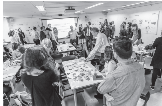
8.2 Uscreates working with healthcare professionals exploring challenges and change

Around both the consultant design studios and the government financed labs we also find a number of thinktanks and innovation groups that are often funded through endowments