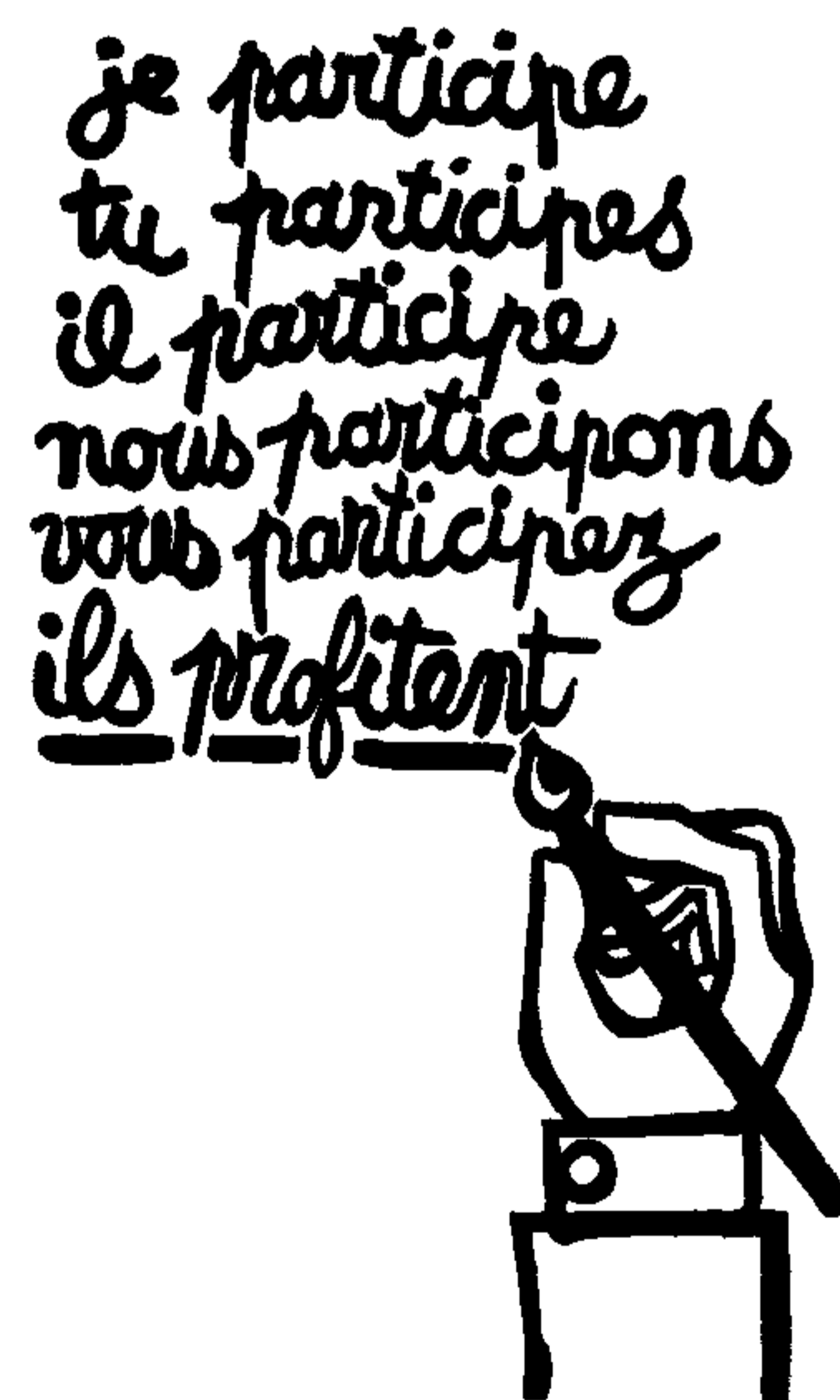
FIGURE 1 French Student Poster. In English, I participate; you participate; he participates; we participate; you participate . . . They profit.

There is a critical difference between going through the empty ritual of participation and having the real power needed to affect the outcome of the process. This difference is brilliantly capsulized in a poster painted last spring by the French students to explain the student-worker rebellion. 2 (See Figure 1.) The poster highlights the fundamental point that participation without redistribution of power is an empty and frustrating process for the powerless. It allows the power-holders to claim that all sides were considered, but makes it possible for only some of those sides to benefit. It maintains the status quo. Essentially, it is what has