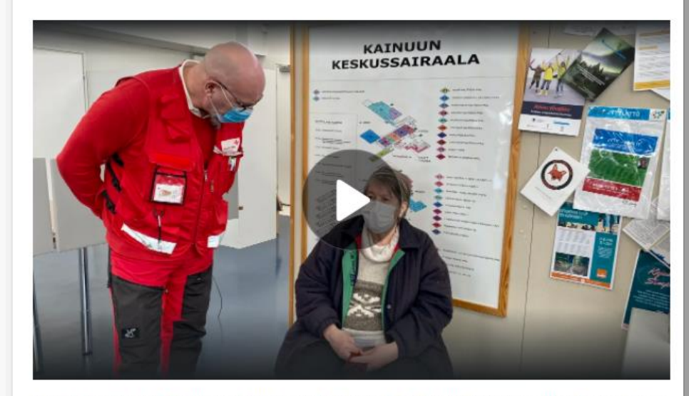
Seurasimme koronarokotuksia ja SPR:n vapaaehtoisten arkea torstaina Kajaanissa.

Liki parituhatta suomalaista on lupautunut auttamaan terveydenhuoltoa koronarokotuksissa, SPR:stä kerrotaan.