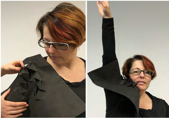
Figure 3. ‘Topology of the Fabric’: draping laser cut fabric directly on the (moveable) body

When applying our EDI framework questions to “Material Props in Context” we note the disruption is caused by how the chosen material is experimentally added to the body in context, without regards for the material’s previous purpose (c.f. Figure 2). Pulling a material out of its usual context destabilises our understanding of that material’s potential; including how it can be used in relation to the body, (and) in a chosen context. What emerges from this action is a re-contextualisation of material properties and experiences and thus new perspectives on the material’s potential in contextualised use. The “Material Props in Context” method thereby embodies material potential.