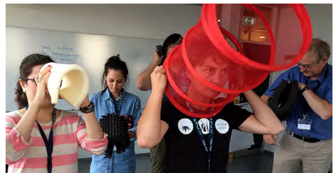
Figure 1. Participants in the first workshop enacting the “Material Props in Context” EID method for the first time.

Our framework has been developed over two workshops held in conjunction with two HCI conferences (Aarhus Decennial 2015 and TEI 2016 [69, 63]). At the workshops embodied design researchers guided all participants through their methods (c.f. Figure 1) then engaged in a broad