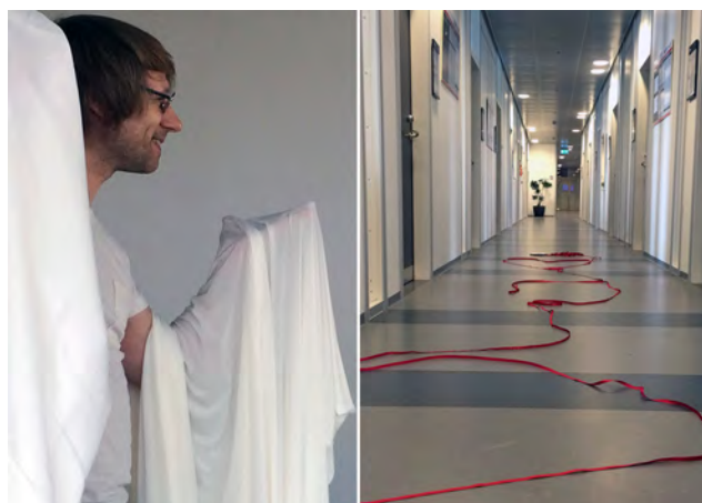
Figure 8. ‘Props for Undesigning’: re-situating everyday actions by means of L: a tube of cloth, and R: a ribbon.

This method disrupts the body by strapping an unfamiliar object to it. With the addition of the simplistic operational questions, this combination destabilises where the attention is and thus what can be imagined using everyday reasoning. What emerges are radical imaginings grounded in desire, which can lead to new concepts for embodied technology design. This method thus embodies latent desires.