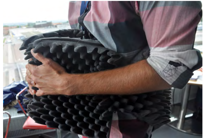
Figure 2. Material Props in Context': Exploring new experiences with a piece of sound insulating material.

In this section we describe each of the eight EDI methods, using the authors own words as well as our experiences from the workshops. We then unpack them further using our framework. Each method is described using this same two-step manner for easy reference and navigation. As addressed in the previous section the first two questions of the framework are used to unpack the act of estrangement and the last question serves to place the method within a genre of theory and related work. The third question – the question of what emerges from the act of estrangement – is useful as means to understand what the methods can be used for and thus also as a means to organize a description