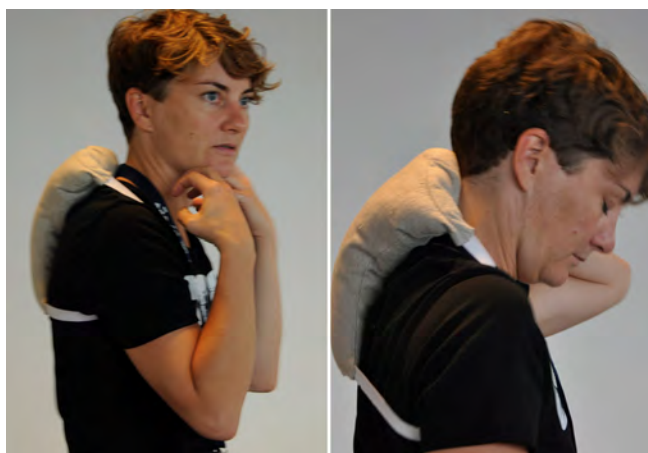
Figure 7. ‘OWL Bodyprops’: embodied exploration of a prop while being interviewed about the desires it inspires.

dynamic potential of social relations between human and non-human actors.