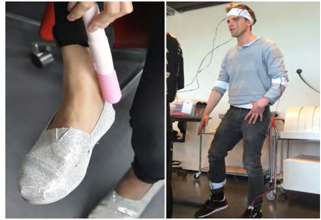
Figure 4. ‘Props for Embodying Temporal Form’: experiments with vibration. L: an off-the-shelf intimate vibrator R: a custom made system to compose vibrating rhythms.

When we apply the EDI framework questions to the “Topology of the Fabric” it becomes clear that by mechanically altering the characteristics of a fabric –