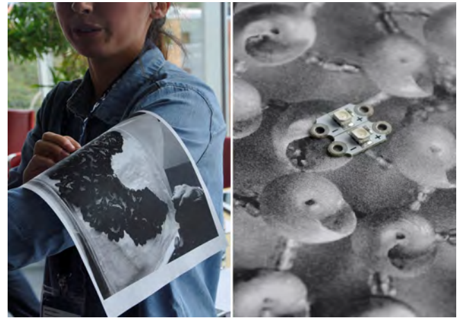
Figure 5. ‘Embodying Past Expressions’: a photocopy of a vintage embroidered embellishment is explored on the body.

When we apply the EDI framework questions we find the disruption in this method is the use of disposable photocopies to represent otherwise fragile inaccessible historical garments and ornamental details. Bringing historical elements into play, in this way, with current technologies destabilises our understanding of how technology might be applied to the body. It allows us to conflate ways that people have worn garments and ornamental elements in the past with current technological potential. What emerges from this destabilisation are new