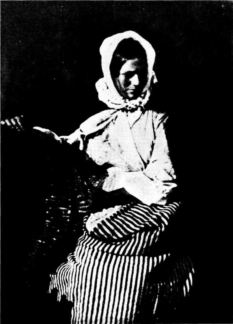
Newhaven Fishwife.