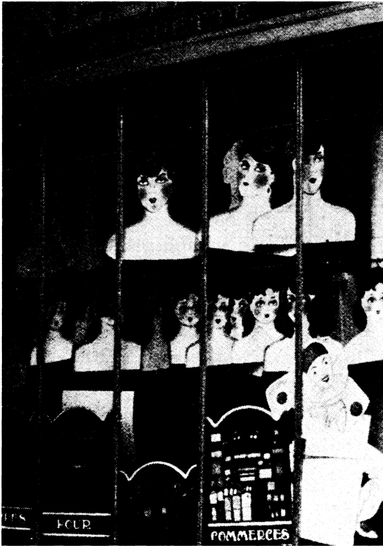
Display Window.