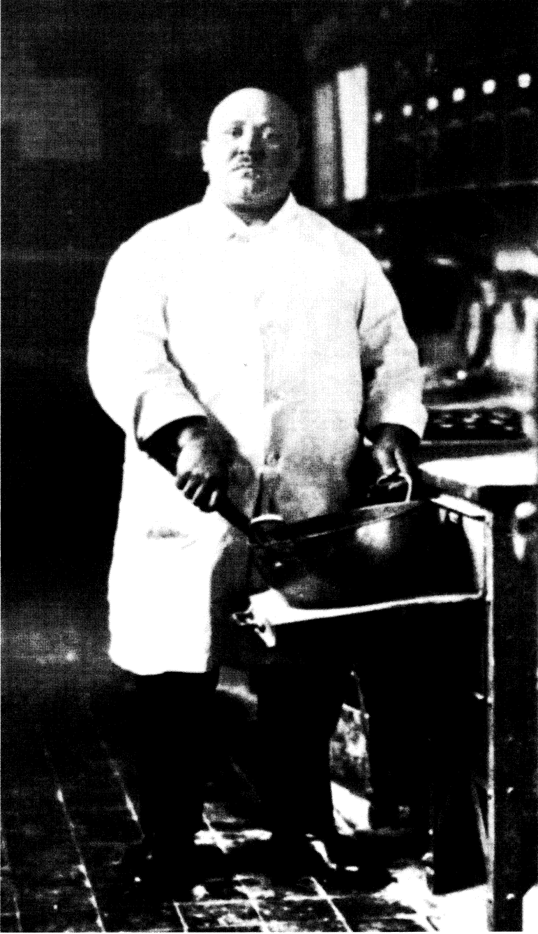
Pastry Cook .