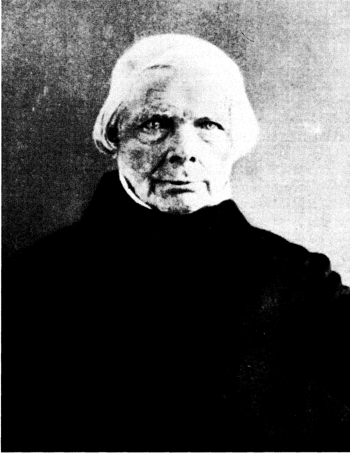
The Philosopher Schelling, ca. 1850.