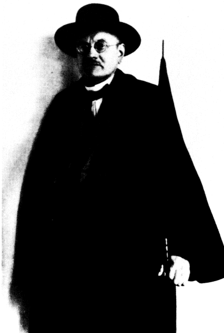
Parliamentary Representative (a Democrat).