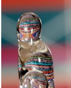
A man of religion (age unknown)