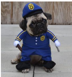
A policeman with a gun (age unknown)