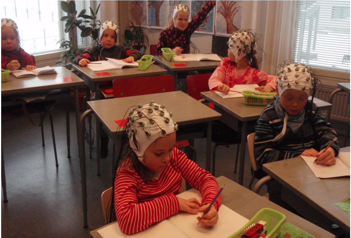
Figure 1: Finnish school children participating in a neuroscientific experiment (mobile EEG) in their natural environment at school.

approaches to the making process and its products.