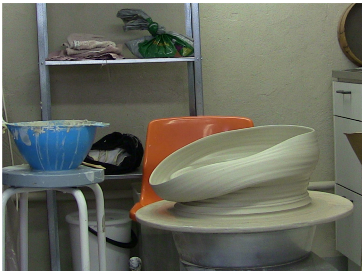
Figure 4: The results of a failed attempt to throw a clay bowl on a potter's wheel.

While arts and crafts can be practised alone, in educational and therapeutic situations the making process is interwoven with social interaction, in which emotions also play a crucial part. Dissanayake (2009, 158) claims that artistic behaviour assists the managing of difficult emotions in circumstances of uncertainty. In the context of art and design education, when young adults are still uncertain about their personal and professional identities, art and craft making has enabled students to ponder on these issues (Figure 5) and served as a method of finding their own way to proceed in their creative practice (Mäkelä & Löytönen 2017, 11–12).