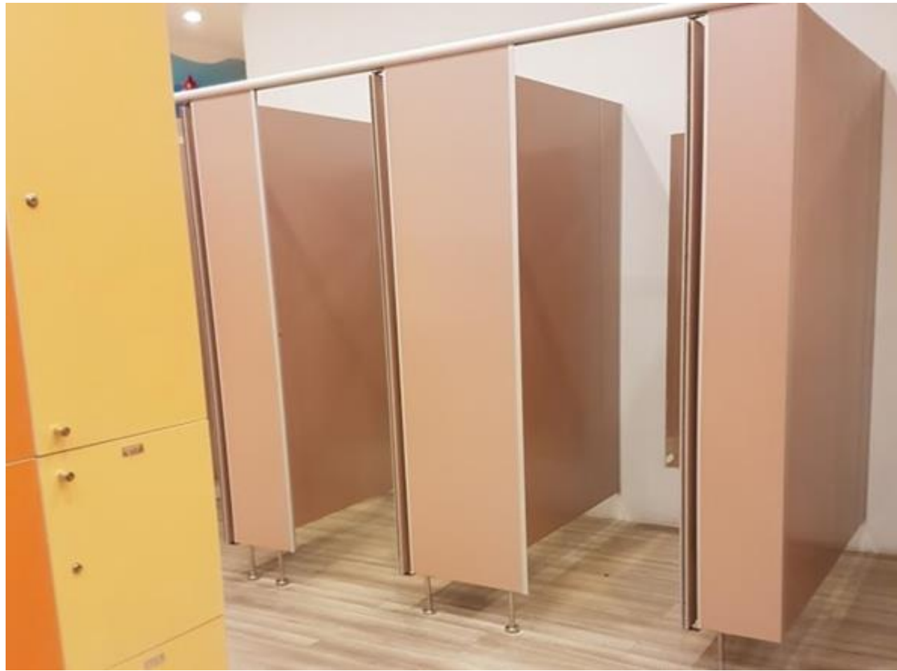
Pukuhuone | Changing room | ห้องเปลี่ยนเสื้อผ้า