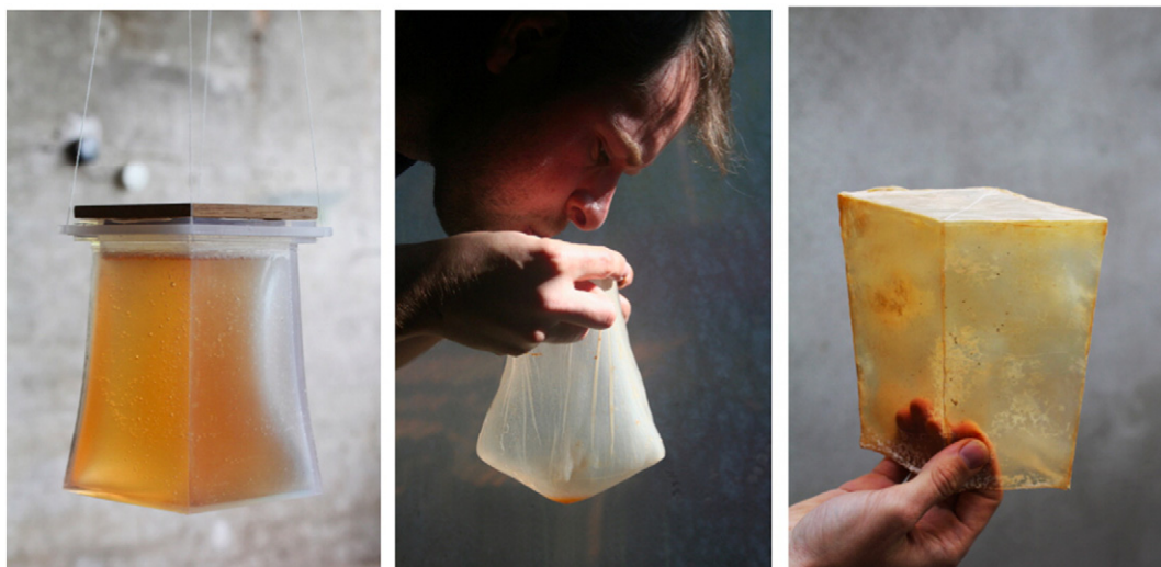
Fig. 5. Xylinum Cones by Jannis Huelsen – Photos by Schwabe/Huelsen.

Coleoptera bioplastic by AAgje Hoekstra developed a plastic made of pressed insect (beetle) shells. After laying its eggs, a beetle dies – with