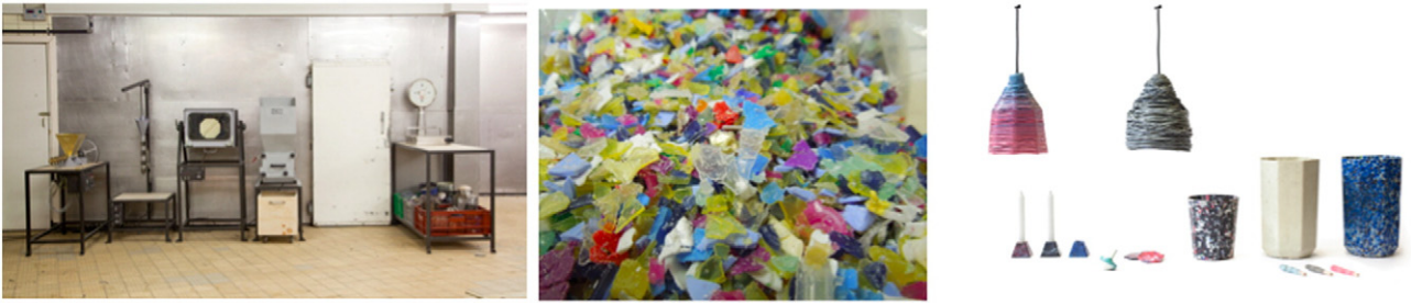
Fig. 11. Precious Plastic by Dave Hakkens, © Precious Plastic.

self-produced nature (i.e. being proud of what one creates). Or, they can generate 'surprise' amongst those who come into contact with the results: finding out, for example, that a given material comes from recycled coffee grounds or from plastics collected from the ocean.