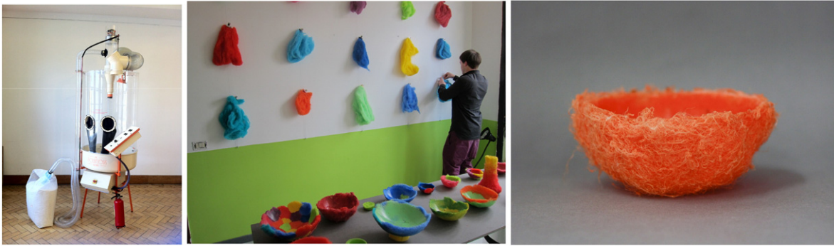
Fig. 9. Polyfloss by the Polyfloss Factory, © Polyfloss Factory.

individual. Each has its own story and a place to be called 'home'. The carefully conceived, free-range kinetic process captures a specific time and place, by permitting the environment to impart distinguishing characteristics. The aim of the designers' conjoint work is to find new approaches and strategies for generating socially sustainable objects. The Viennese team is thereby addressing issues of socioeconomic and cultural relevance concerning spaces and artefacts.