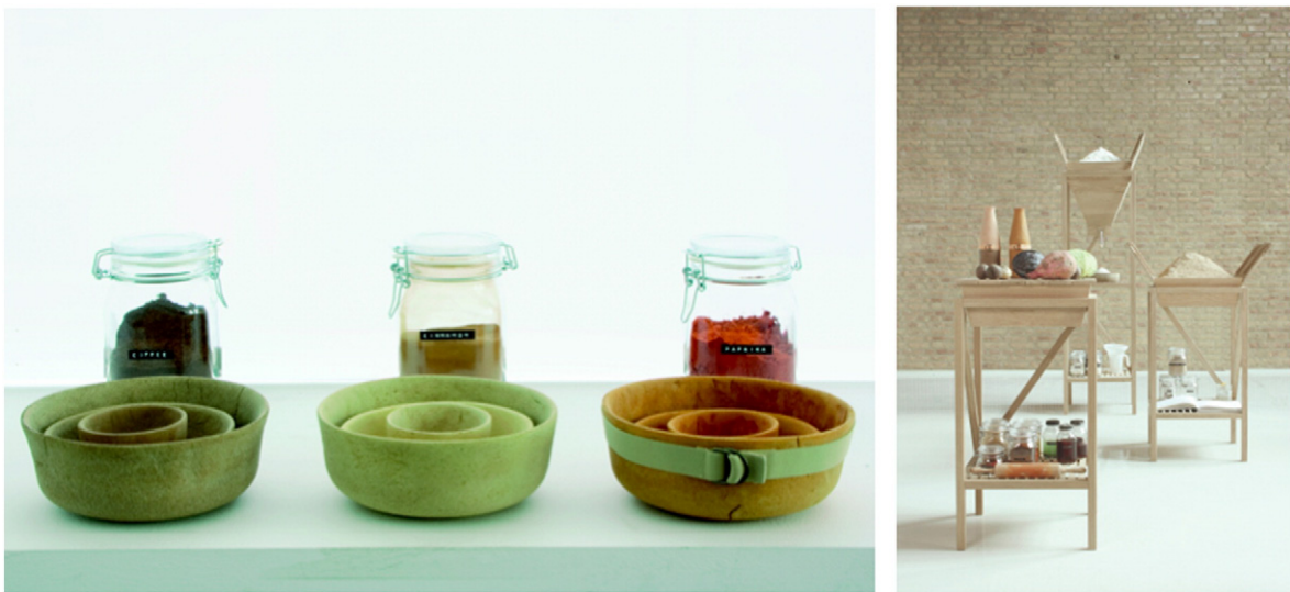
Fig. 2. Autarchy Vessels designed by Studio Formafantasma, © Studio Formafantasma.

pulverizing, pressurizing, and adding heat, using a tub grinder and a kiln. The raw material comes from demolition and construction waste or manufacturing refuse with no binders required. This opens the possibility for a continuous, waste-free production cycle.