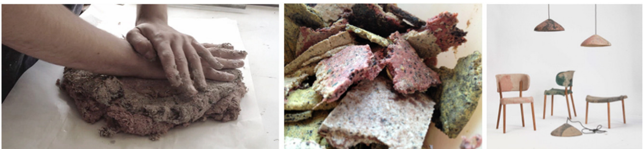
Fig. 3. Impasto by Nikolaj Steenfatt.

Xylinum Cones by Jannis Huelsen presents a production line, using living organisms to grow geometrical objects. The project uses bacteria cellulose characterised by high purity, strength, mouldability and increased water-holding ability (Fig. 5). After a growth period of three weeks, the cellulose cones are dried and added to a sculptural assembly. The main motivation of the Xylinum Cones is on the one side to prove