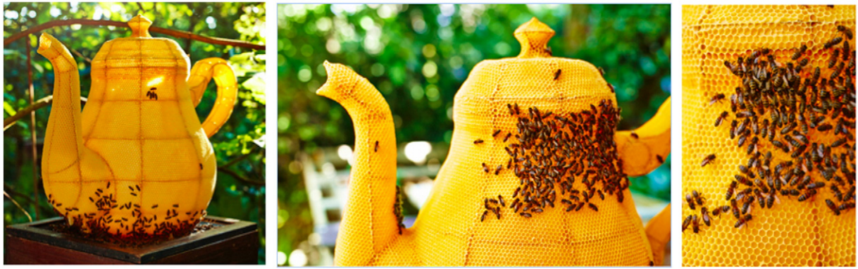
Fig. 6. Thousand Years by Tomas Libertiny – Photos by Rene van der Hulst.

the result that insect farms in the Netherlands throw away 30 kg of dead beetles every week. Before the beetles are disposed of, Hoekstra peels them so she is left with just the shells, which are made of a natural polymer called chitin that is also found in crab and lobster shells. She uses a chemical process to transform the chitin into chitosan, which bonds better due to a variation in the molecular composition. The material is then heat-pressed to create a plastic, with the oval-shaped shells still visible. The plastic is waterproof and heat resistant up to 200 °C.