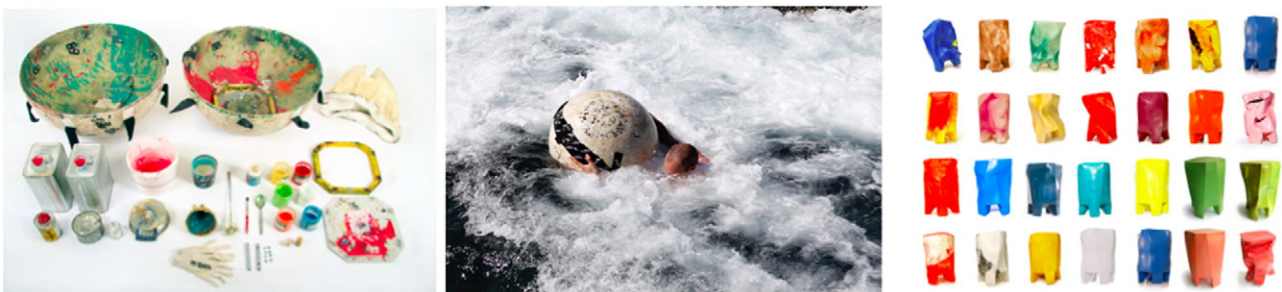
Fig. 10. Original Stool by breadedEscalope, © breadedEscalope.

In creating DIY materials, design capability is influenced and shaped interchangeably through 'learning by doing' and 'learning by interacting'. Designers express themselves in making: creating unique materials and products that can reveal their personal touch. Common to all design cases presented in this article is the designers' ability to create unique, personal, and non-repeatable (material) applications. These manifest through imperfect surface qualities, attributable to the uniqueness of the performance that defines self-production processes. As Lee [20] argues, in DIY material design practices, the designer becomes an alchemist willing to self-produce materials following the magic conversion of a substance into another. " Material perfection was sought through the action of a preparation (Philosopher's Stone for metals; Elixir of Life for humans), while spiritual ennoblement resulted from some form of inner revelation or other enlightenment (Gnosis, for example, in Hellenistic and western practices)" [21]. In DIY material design practices, the designer becomes a craftsman, able to build and to modify the tools for his/her production aims. A result of the DIY material design process is new aesthetic expressions grounded on 'imperfect aesthetic qualities' that show the existence of an alchemist's (i.e. designer's) manual labour and craftsmanship, and hence traces of humanity. On an emotional level, DIY materials can facilitate 'attachment' due to their