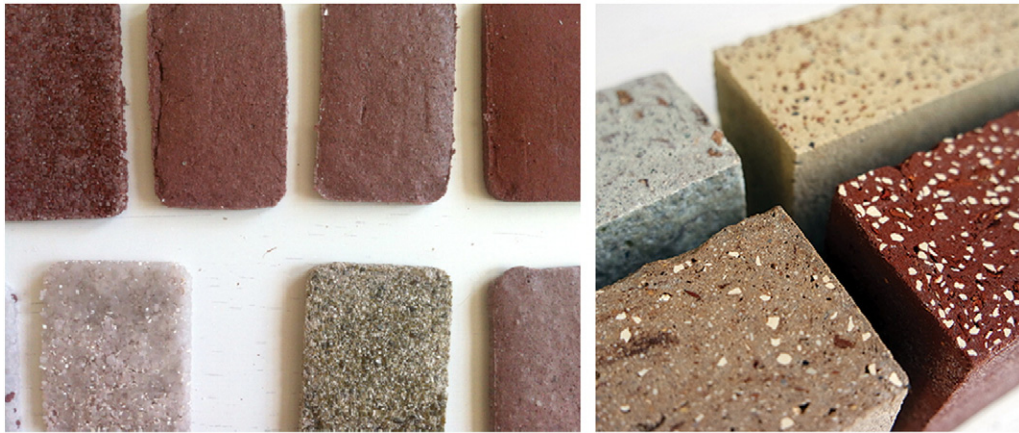
Fig. 4. StoneCycling by the Dutch designer Tom van Soest, © StoneCycling.

the reproducibility of organically grown objects, but on the other side to find a balanced level of geometric precision and organic diversity. The aim of the project is to create a transparent production cycle and tangible objects, which allow the building of a relationship with a new and culturally unloaded material.