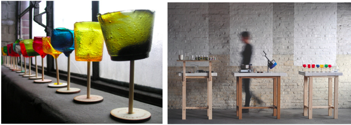
Fig. 1. Shaping Sugar by Amalia Desnoyers, © Amalia Desnoyers.