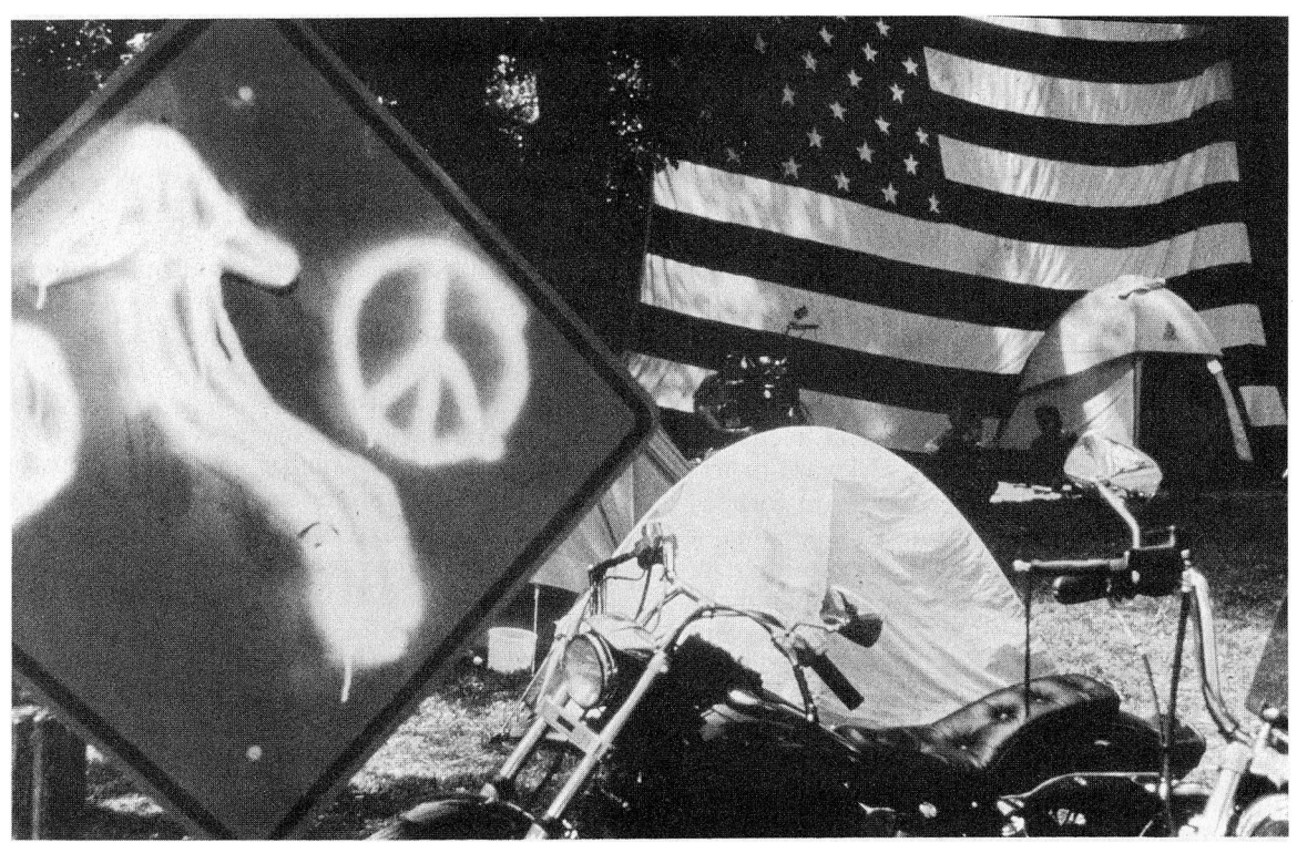
FIGURE 4 GROUP CAMP SITE AT AN IOWA ABATE "FREEDOM RALLY"

feel their livelihoods are directly threatened by imported goods. Their "buy-American" creed extends beyond their motorcycles to include the purchasing of clothing, automobiles, tools, and accessories, and they are resentful of people who do not share their loyalty. RUBs, in contrast, while proud of their American Harleys, often prefer Japanese or European automobiles and, in general, shop for quality and value before country of origin. Part of the appeal of Harley-Davidson across subgroups of the HDSC is their perception of the motor company as an American folk hero in an economic war with Japan.