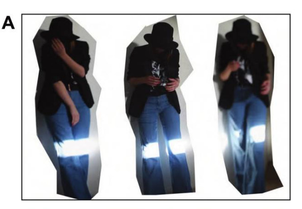
FIGURE 4 PROFESSIONALIZATION OVER TIME

This progression can be viewed as the logical consequence of a commitment to aesthetic discrimination. Aesthetically pleasing clothes cannot look their best unless effectively photographed. As soon as the blogger begins to be photographed modeling clothes, she must deal with the visual and aesthetic vocabularies already established by the