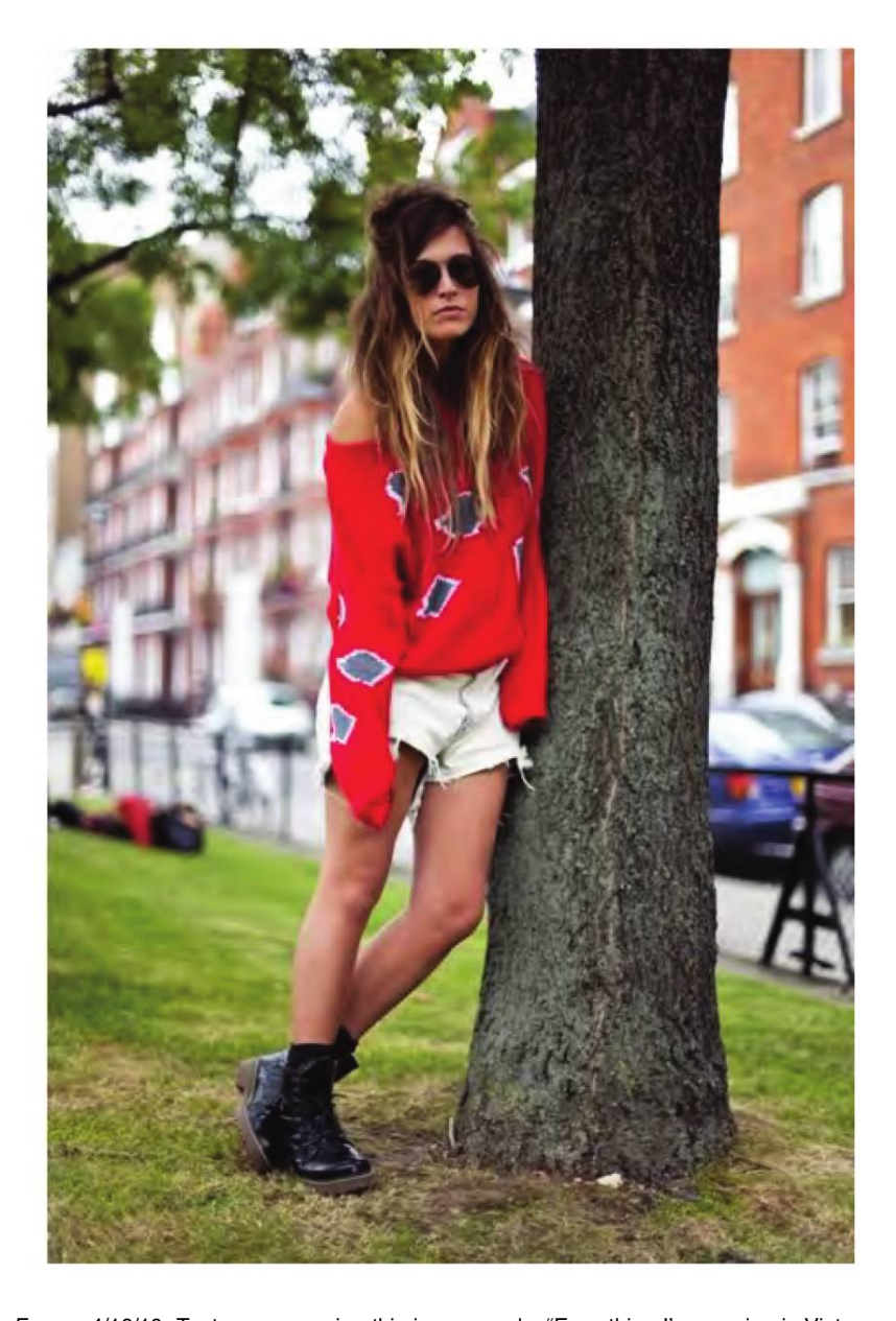
FIGURE 1 VENTURESOME TASTE DISPLAY

Note.—Sourced from Frassy , 4/16/10. Text accompanying this image reads: "Everything I'm wearing is Vintage, except the Doc Martens. . . . Those babies are fakes, and now the black plastic is peeling away, which I kind of love. The city is beautifully sunny today. I'll be outside all day reading Victorian literature."