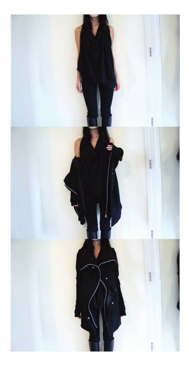
NOTE.—Sourced from Childhood Flames , 11/14/09. Post used wordplay in its title: "A Little Something from New Yoak City."

paid advertising on her site but had not received the invitations, free clothing, sponsorships, designing opportunities, or publicity of the other nine blogs (table 1). Her refusal to move from curator to model by not showing her followers how she styles herself appears to limit her success in the