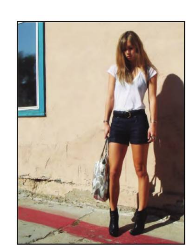
FIGURE 5 EVOLUTION OF AESTHETIC STANDARDS

As their audience continues to grow, bloggers come to the attention of the promotional element in the fashion system, which sends economic resources their way, in terms of gifts of merchandise, money for ad placements, and so forth. These resources, which fuel further taste ventures, act to increase the blogger's audience, which maintains the flow of resources, thus setting up a positive feedback loop. As their audience grows, bloggers also gain social connections to prominent insiders within the fashion system, which lends bloggers more prominence, which again maintains or enhances the size of their audience among ordinary consumers, while also reinforcing the audience's perception that the blogger is a taste leader (Pham [2011] describes this as a "prominence dividend"). Having and growing an audience makes a blogger valuable to marketers and to fashion insiders alike, and the interest of both acts to enhance her