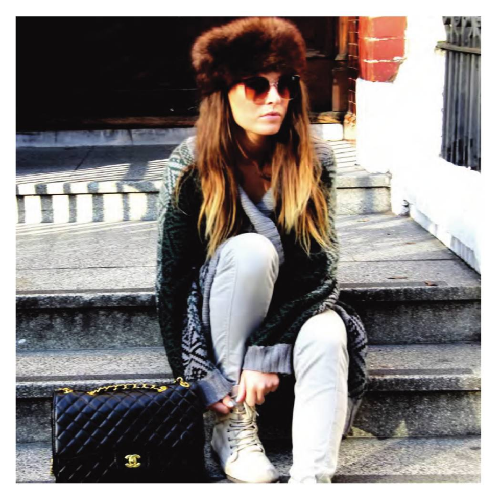
FIGURE 2 RANGE OF TASTES DISPLAYED WITHIN A BLOG