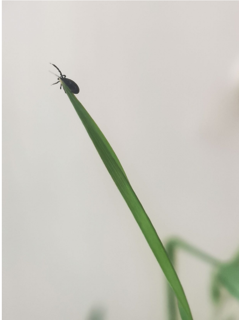
Figure 2. A questing tick, 2021.

been stated as the author's attempt from the beginning of this investigation on/with ticks; but how does one measure success in this and what does (learning) with actually mean in this context? The paper leaves this important question open and focuses primarily on reporting about the insights gained on ticks from the sciences and the arts. What has become utterly clear during this period is that our, often involuntary, connection to this organism is multi-layered. A tick is an important part of a complex ecosystem. A tick is a vector. A tick is an ectoparasite. A tick belongs to the Arachnida class along with spiders. There are many different species of ticks on the planet – in Finland we have primarily two species. A tick eats three times during its life. A tick is blind. A tick carries numerous pathogens. An urban tick lives in the city. A tick has impacted our evolution. A tick is today feared by humans.