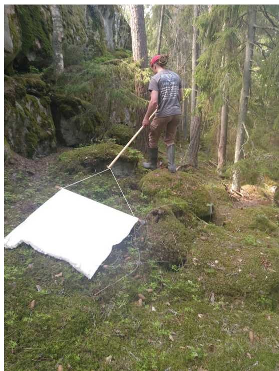
Figure 7. Collecting ticks 2019; Seili island.