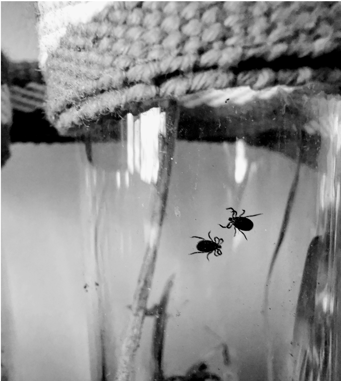
Figure 1. Ticks in the Terrarium, 2021.

This article reports on an artistically driven investigation of ticks. This investigation has been an intermittent on-going affair for 2.5–3 years. The initial approach for this investigation, similarly to the call for this journal’s special issue, emphasises learning with rather than about others and non-humans. This has also