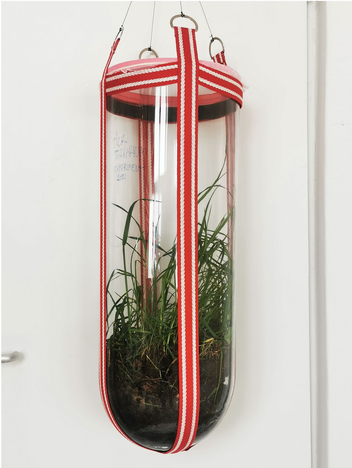
Figure 4. Tick Garden / Punkki Puutarha 2021.