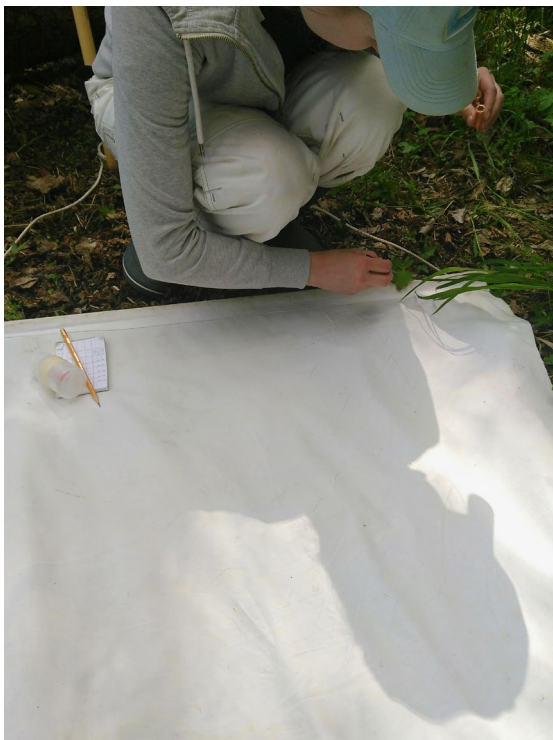
Figure 6. Field work with scientists 2019; Seili island.

The Tick Terrarium is also an attempt to build a small-scale habitat for the ticks which is supported by the wearer's body heat (sensed by ticks). The Tick Terrarium has openings for oxygen and for watering the habitat environment. The several glass compartments are connected with plastic tubes to provide access for ticks to move from one compartment to another. However, until now there have been no sign that this feature would be used by ticks. The wearable design of the Tick Terrarium