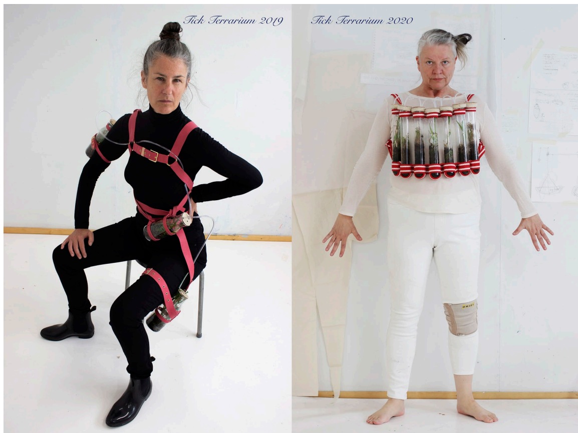
Figure 3. The Tick Terrarium 2019 version and the Tick Terrarium 2020 version.

commonly a ride for a tick is a deer, a dog or another mammal that lives in its vicinity, with shorter distances involved.