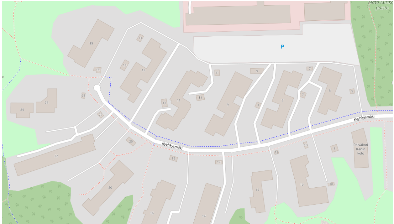
Figure 2. Map view of Catchment 1 in OpenStreetMap ( https://www.openstreetmap.org/#map=18/60.22873/24.80922 ).