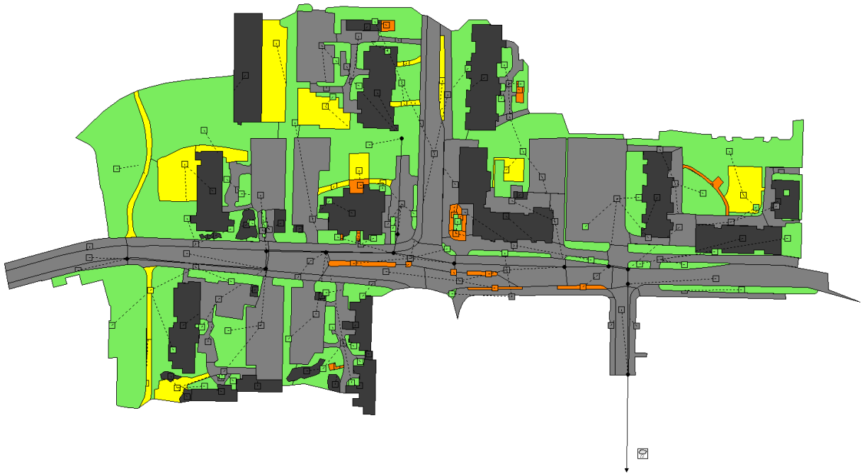
Figure 1. SWMM model view of Catchment 2.

Catchment 2 is built around an intersection of three vehicular streets, Lintuvaarantie, Vallikatu and Kyyhkysmäki (Figure 1-2). It has a mixed land use, including residential buildings with parking areas, and small commercial blocks including e.g. restaurants and a grocery shop. There are also some gravel/sand areas, mainly on playgrounds. About 56% of the catchment is covered with constructed impervious surfaces, of which a considerable proportion (>70%) consists of traffic related areas (Table 1). Overall, the catchment area is rather steep as there is a 10 m elevation difference between the upstream and downstream ends of the sewer system; however, rather flat areas can be found inside the catchment area (Figure 3).