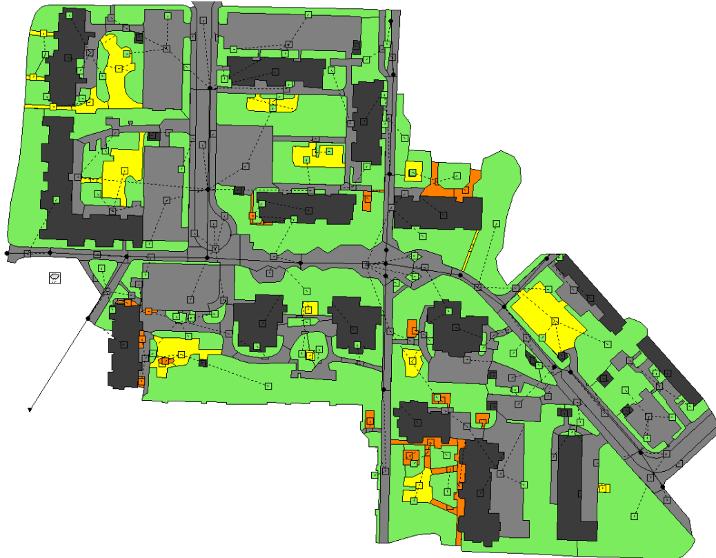
Figure 1. SWMM model view of Catchment 3.

Catchment 3 comprises 3-4 storey residential buildings. The yard areas usually contain a parking area and a sand/gravel areas as playgrounds (Figure 1). There are only two small short stretches of vehicular roads at the opposite ends of the catchment, Rautakiskonkuja and Vallikuja streets (Figure 2). Otherwise all roads are walkways without vehicular traffic. Hence, the proportion of vehicular roads is only 3% in Table 1. Overall, the impervious constructed land cover within the catchment is rather evenly distributed to roofs, walkways, and parking areas (Table 1). There is about a 9 m difference between the upstream and downstream ends of the sewer system; however, rather flat areas can be found inside the catchment as well (Figure 3).