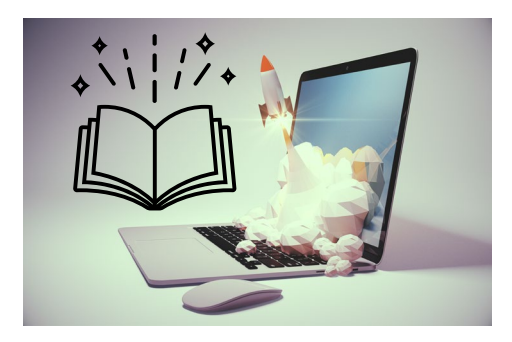
Writing the thesis