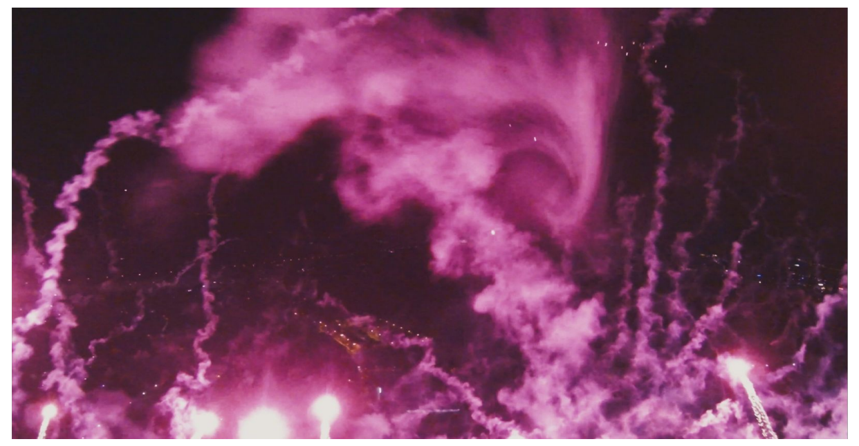
Still from "Nightlife" by Cyprien Gaillard

"The classic, common sense trinity—what is art? what is politics? what is their relation?—becomes obsolete as soon as it is acknowledged that there is not a single, ontological answer to any of these questions."