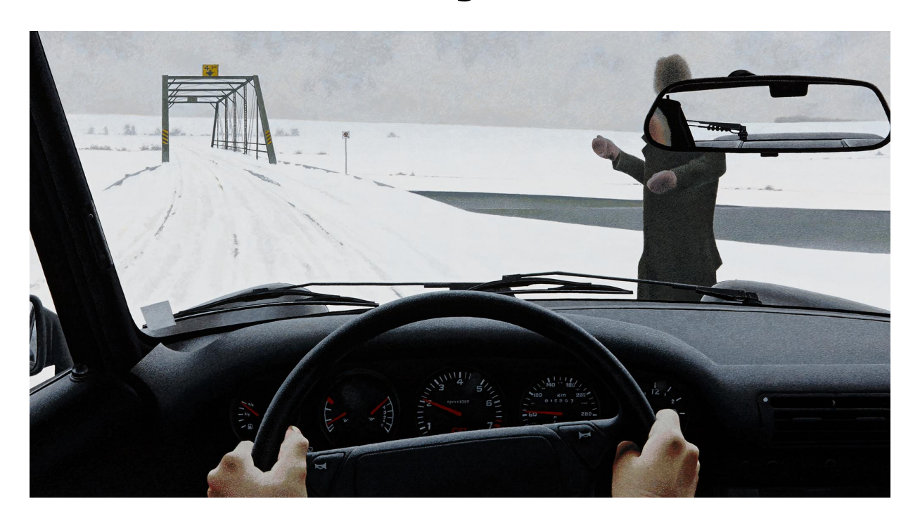
"Traveller" by Alex Colville