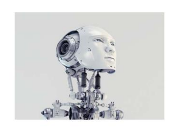
AI & ML