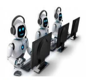
Robotic Process Automation