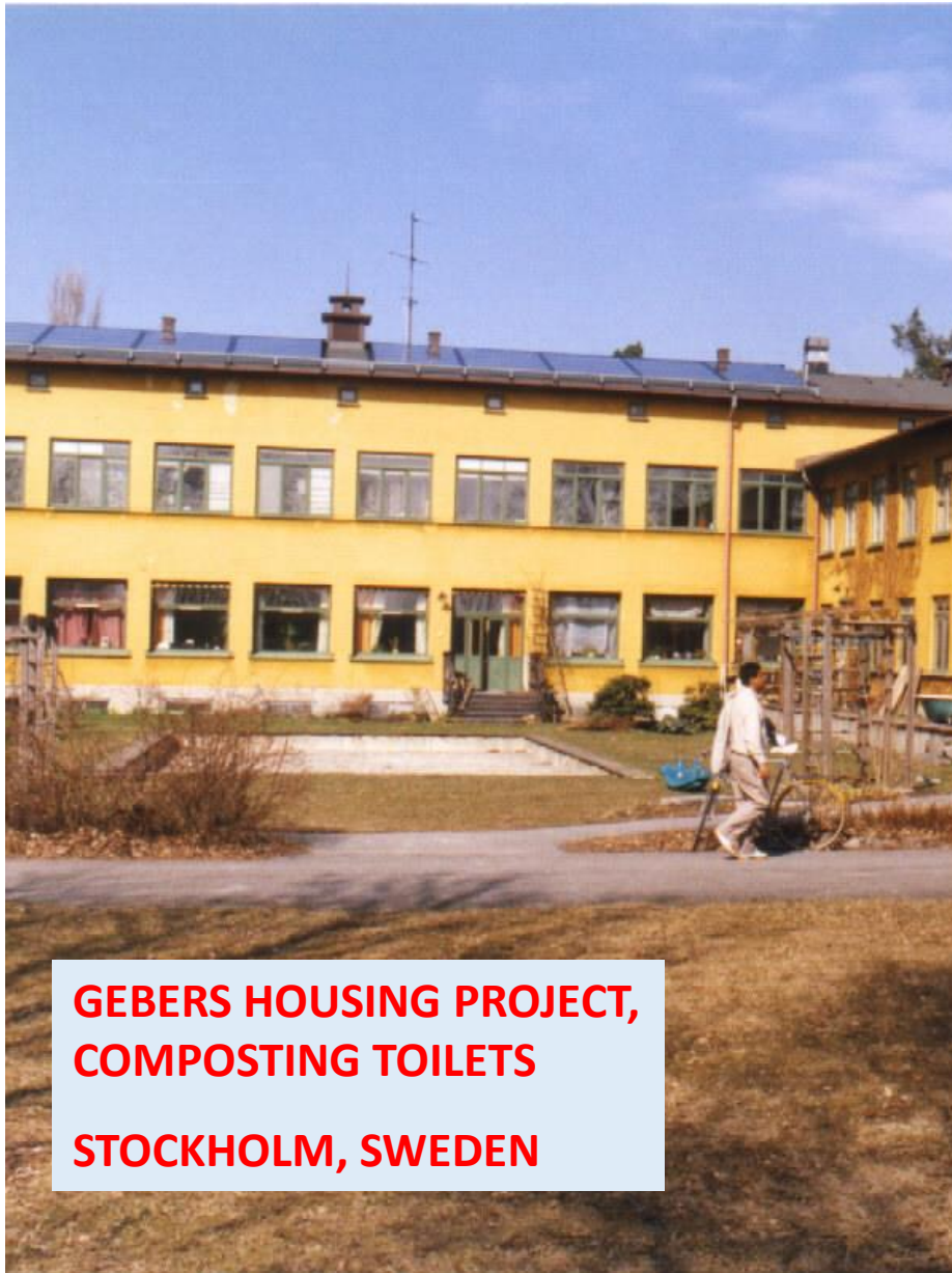
GEBERS HOUSING PROJECT, COMPOSTING TOILETS STOCKHOLM, SWEDEN