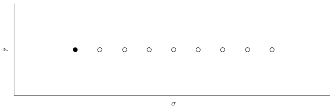
Figure 2: \bar{r} - \sigma diagram of Exercise 4.

a) The three assets are on a single horizontal line. The efficient set is a single point on the same line (shaded black in Figure 2), but to the left of the left-most of the three original points.