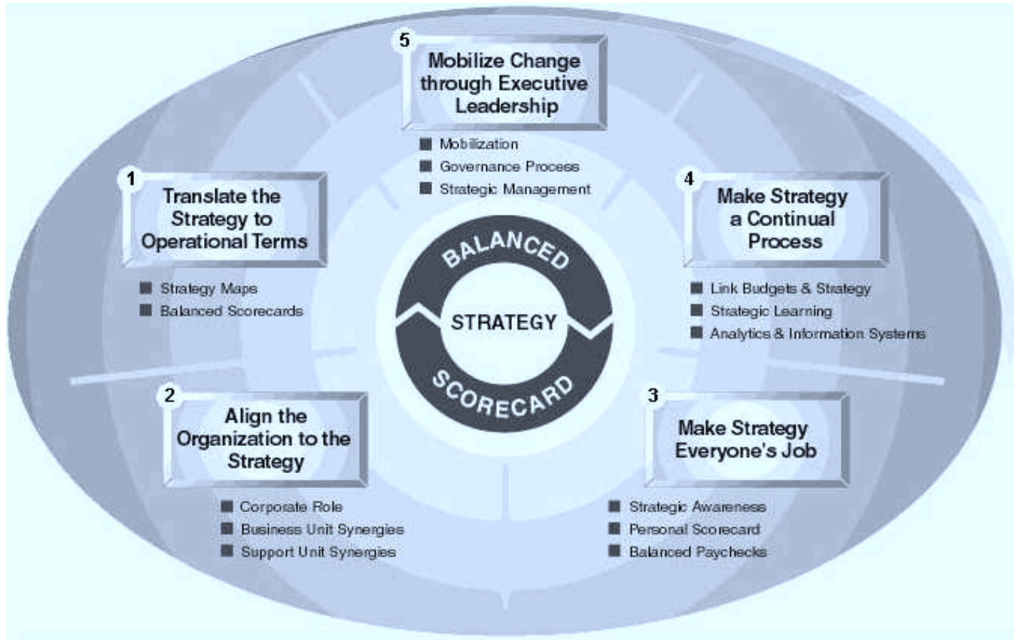
FIGURE 1 The Principles of a Strategy-Focused Organization