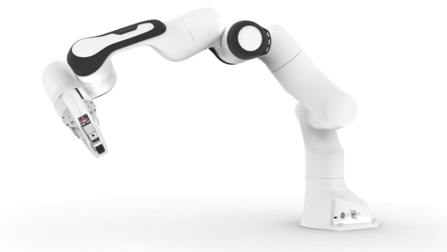
Figure 1: Franka Emika Panda robotic arm

The robot The robot that you will perform the experiments with is the Franka Emika Panda robotic arm (shown in Figure 1).