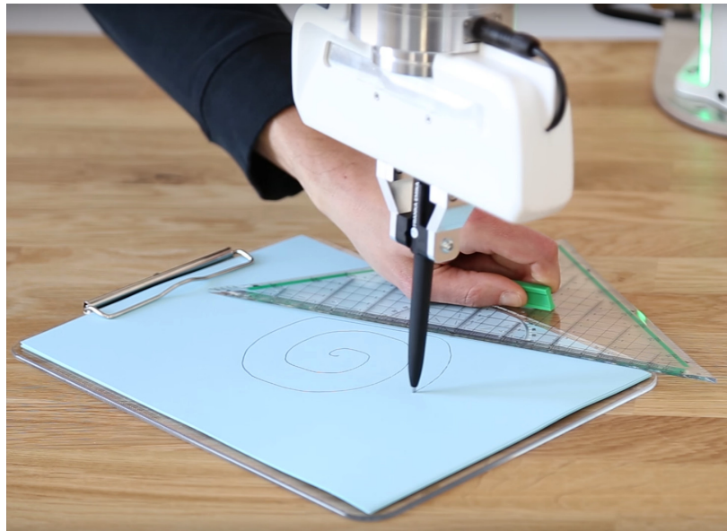
Figure 3: The setup for Task 3

Task 3 In the third task the robot will be setup with a pen in its gripper and a sheet paper will be positioned on the table. On top of the sheet of paper, a ruler will be placed. The robot has to perform a spiral motion in contact with the paper. Whenever the pen touches the ruler, the robot should follow the ruler and then continue the spiral trajectory, as shown in Figure 3.