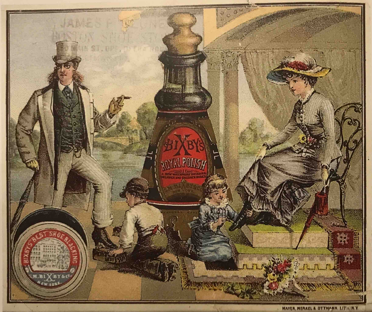
▲ 14. Trade card for Bixby's Royal Polish for ladies' shoes and satchels and Bixby's Best Blacking for Gents' boots, ca.1880, chromolithograph. Author's collection.

were blackened at a shoe repair shop or at home before a social occasion, a weekly ritual "child-and-nanny Sunday walk," 64 or simply to dress appropriately for a standard office job. One French case ironically consisted of a "healthy man who went to a funeral in yellow shoes which had been blackened . . . was seized with vertigo and passed into a state of cyanosis." 65 Cyanosis, or lack of oxygen in the blood, which caused extremities and lips to turn blue or black, was one of the most distinctive visual symptoms. Two French