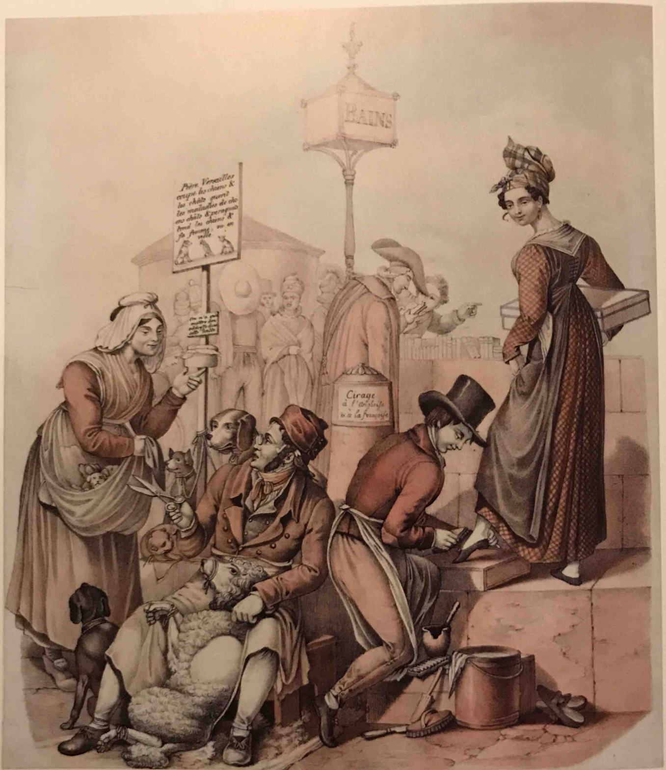
▲ 13. Street vendors on the Seine in Paris: A pet groomer, a shoe shiner, and a bookstall, early 19th century. Wellcome Library, London.