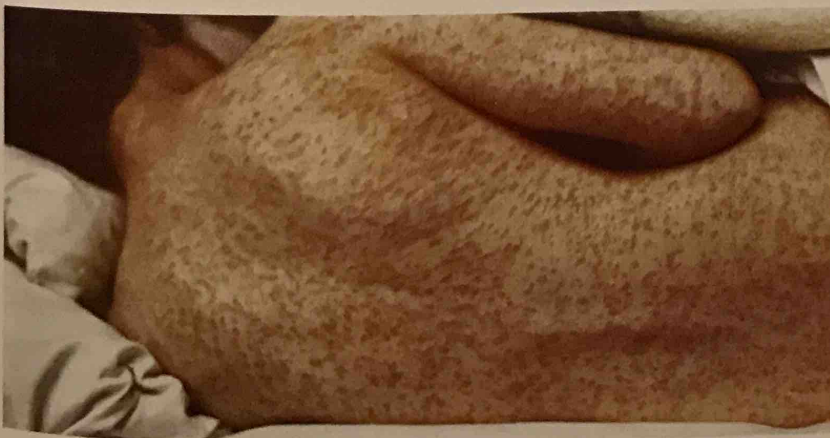
◀ 7. Back of a female showing a case of measles. From Ricketts, The Diagnosis of Smallpox (London: T.F. Casell and Company, 1908), Plate XCIII.

The development of aniline dyes affected all of society and led to many further scientific, medical, and commercial applications. These included the advent of immunology and chemotherapy, allowing researchers to stain and identify the tuberculosis and cholera bacilli, and led to synthetic perfumes and food colourings. 16 On the flip side, many of its derivatives were toxic, and aniline-based compounds became the raw materials for deadly explosives. Yet despite these dangers, the story of Perkin's invention is retold in many celebratory texts and images. Whereas arsenic could create convincing green leaves, colours like mauve and fuchsine, named after flowers, could recreate and seemingly improve upon the shades of nature. As All the Year Round put it, the "dull brown purple" of the mallow flower was "utterly unlike the delicious Violet of Perkin." 17 Fuchsine, discovered by the Frenchman Emmanuel Verguin in 1859, was a "rich crimson red" used in large quantities for military uniforms. By the end of the year, it was all the rage as a fashion colour. 18 In England, it was triumphantly named after victorious battles, first Solferino, then Magenta, after the French-Austrian encounter in 1859. As a brilliant magenta