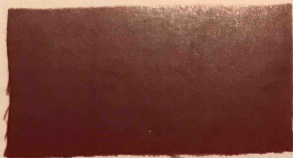
CORALLIN ON WOOL.