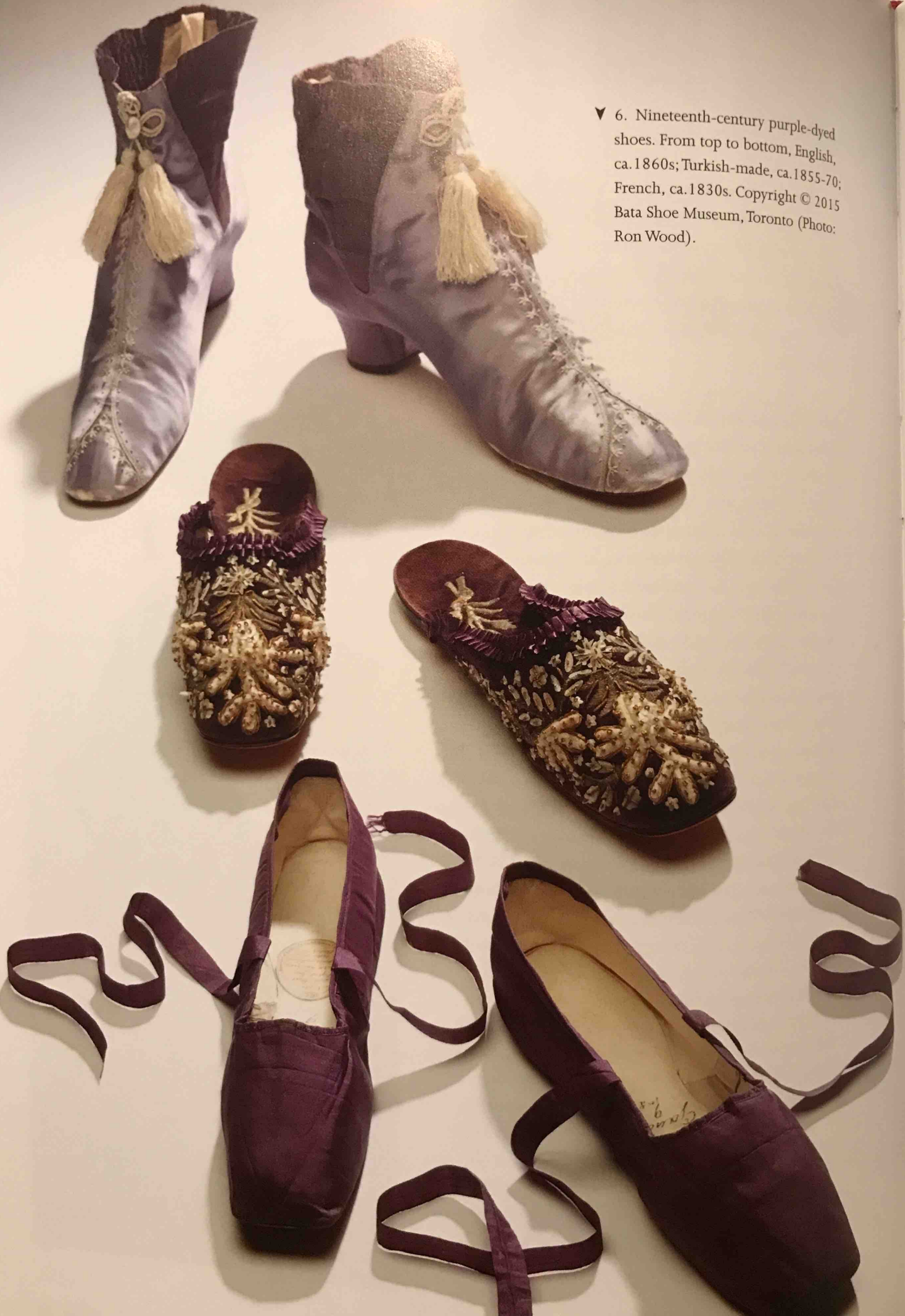
▼ 6. Nineteenth-century purple-dyed shoes. From top to bottom, English, ca. 1860s; Turkish-made, ca. 1855-70; French, ca. 1830s.