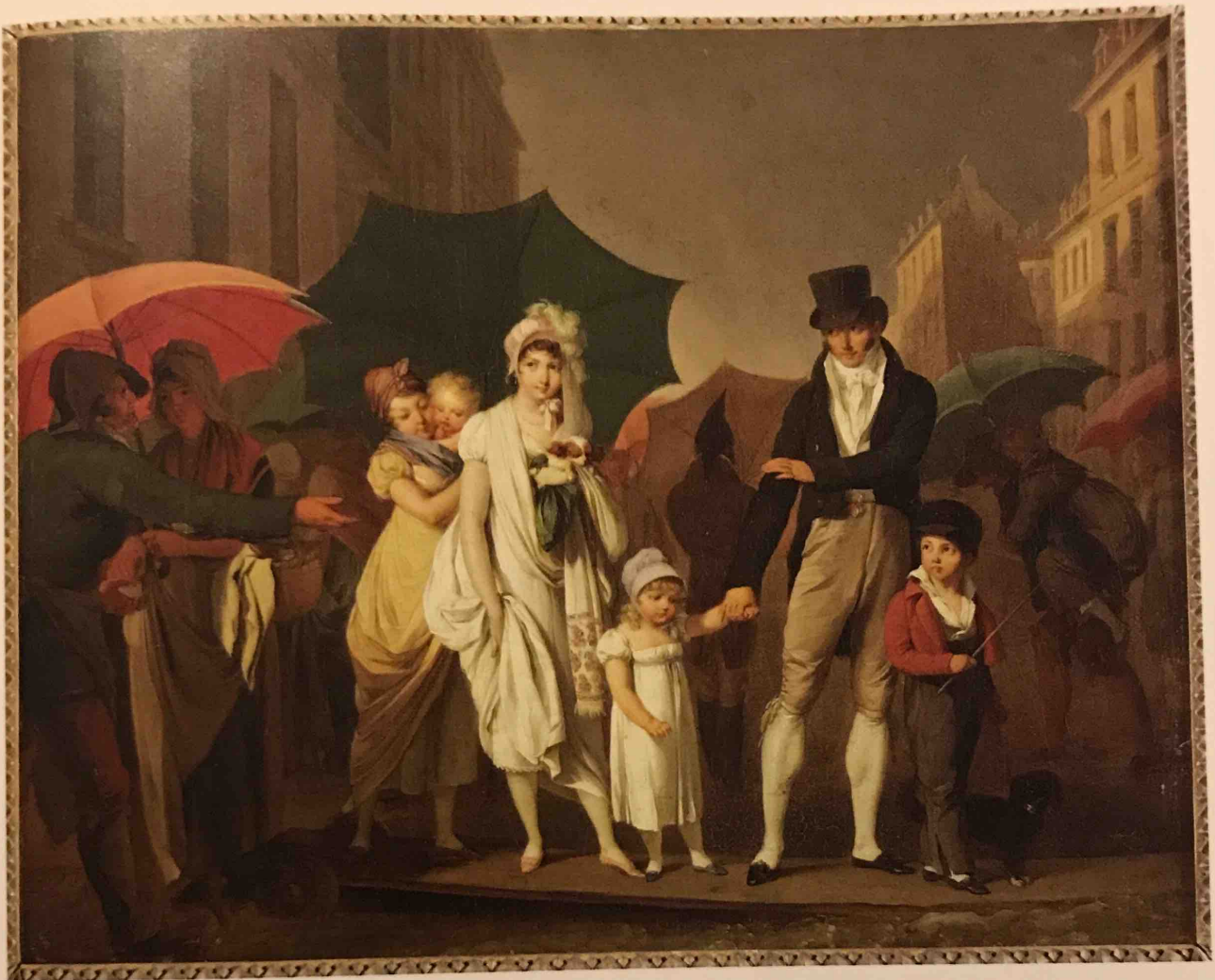
▲ 12. Louis-Léopold Boilly, The Downpour or Passez payez , 1803. Musée du Louvre, Paris, France (Photo: Erich Lessing / Art Resource, New York).

remover” was stationed at either end of the arcade to clean the footwear of those coming in. 54 Yet when it rained in Paris, streets became almost unnavigable. Clever entrepreneurs provided a solution. They wheeled out planks of wood and charged a toll for their use, allowing wealthy families like the one depicted in Boilly’s painting to cross the streets unsoiled on these impromptu bridges (Fig. 12).