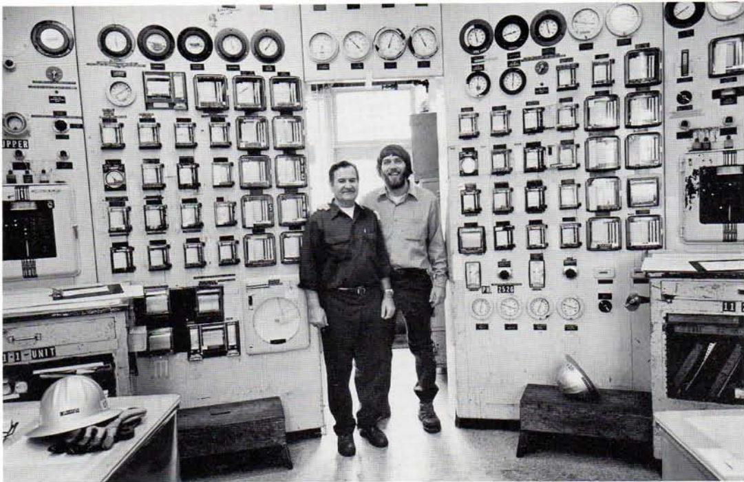
Control Room of a Crude Oil Distillation Unit, Standard Oil Refinery, Richmond, California, 1977.