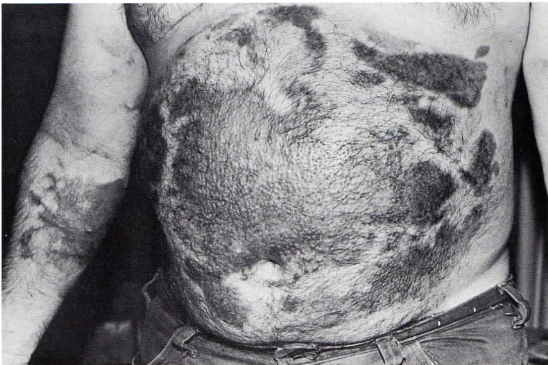
OIL WORKER'S BURNS. "When it really comes down to the nitty-gritty it's the employees themselves who won't really make a stand on safety. When it comes down to the bread-and-butter issue, if you make a strike issue over a safety matter, it's going to take a lot more education, in my opinion."